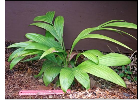
Calyptrocalyx elegans planted one year ago