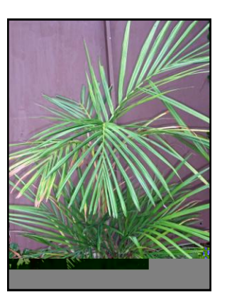
Calyptrocalyx forbesii planted 6 years ago