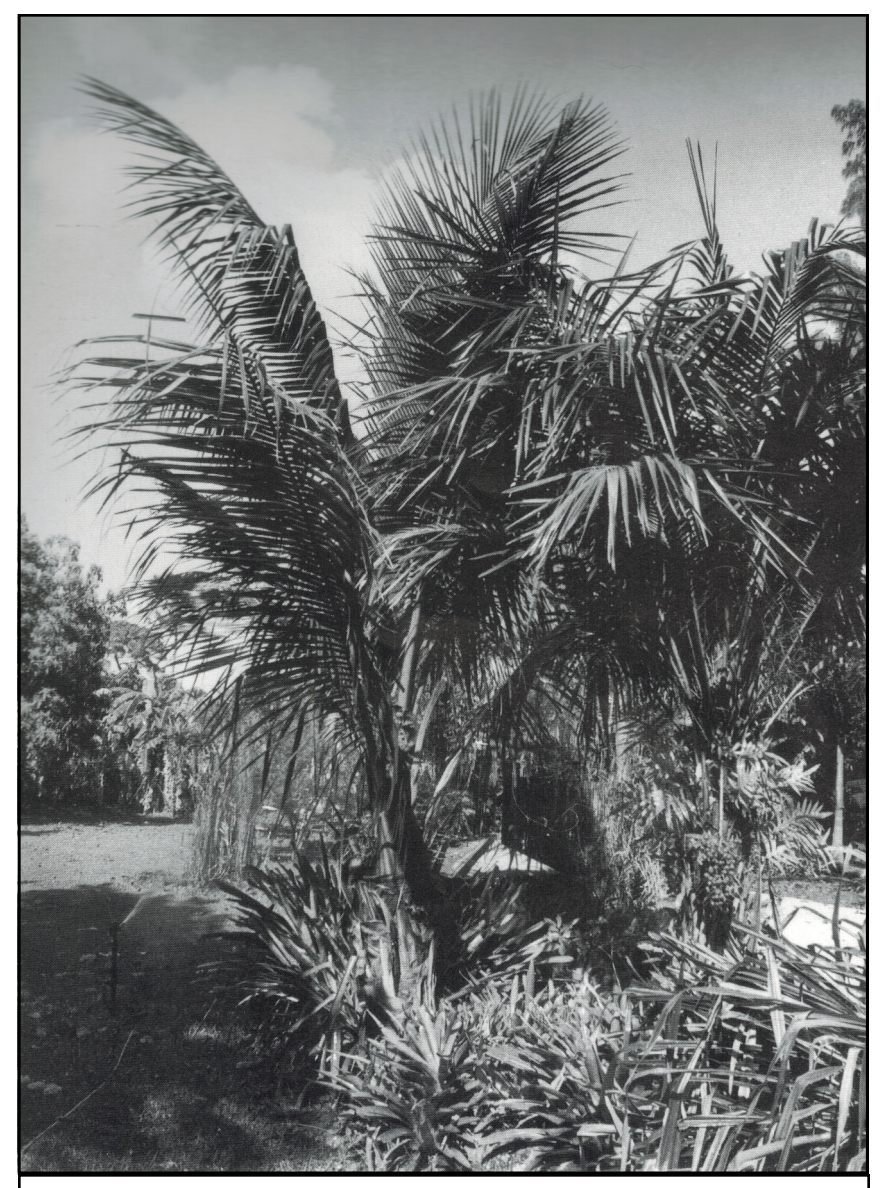
Fig. 3: In the department of total confusion, a young Cocos nucifera challenges an older Syagrus schizophylla .