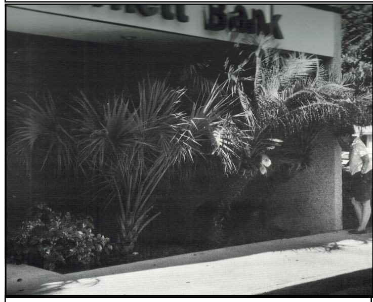
Fig. 6: Poorly matched Sabal sp. and Phoenix sp. must contort to escape planted niche.