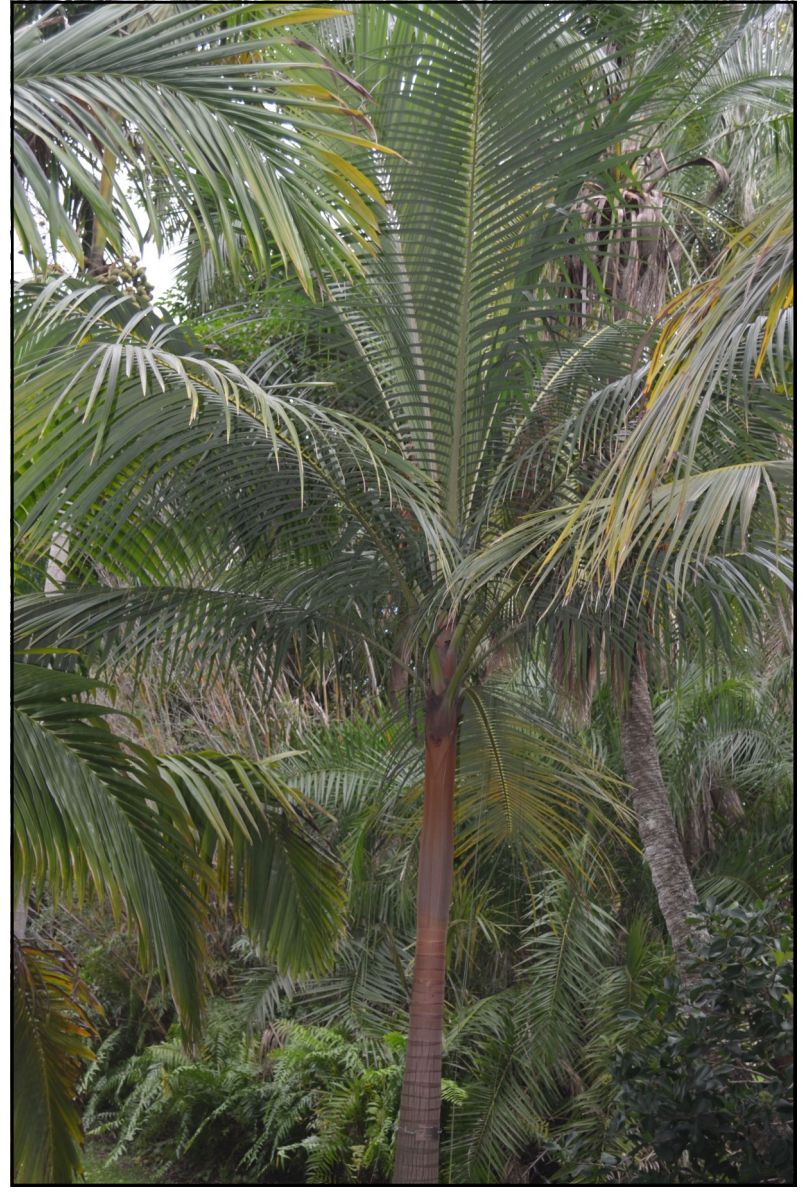
Acanthophoenix rubra growing in lowlands at Fairchild Tropical Botanical Garden.