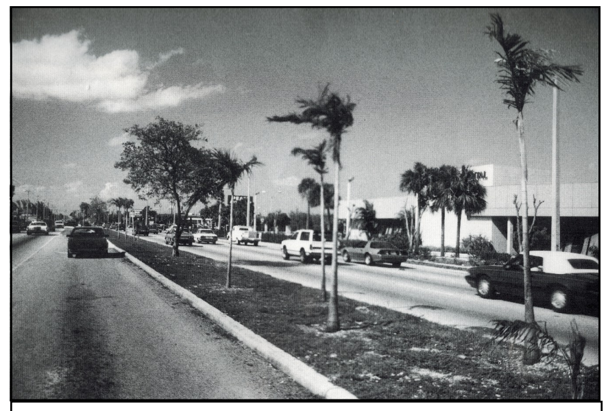
Fig. 1: The median of arid highway U.S. 1 boasts miles of unhappy Carpentaria acuminata .