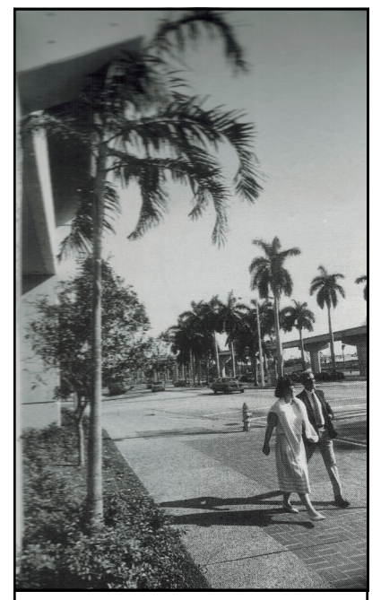
Fig. 2: One of several ill-fated Carpentaria acuminata and regularly spaced, irregularly sized Roystonea regia on Miami's Biscayne Boulevard.

lovers, but palm lovers have, by definition, potential to treat palms better. There are, regardless, so many poorly placed palms and so many poorly designed gardens that too few palm planters realize that the locating of any palm, anywhere, is an act of design, and that they are, whether they choose to think on it or not, responsible for the consequence of their acts. Perhaps simplistic rules could provoke responsibility and jog some imaginations without offending those who are totally certain of their own competence. With hope