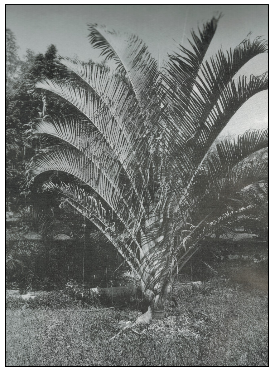
Fig. 4: Neodypsis decaryi , popular in south Florida, wants to be alone.