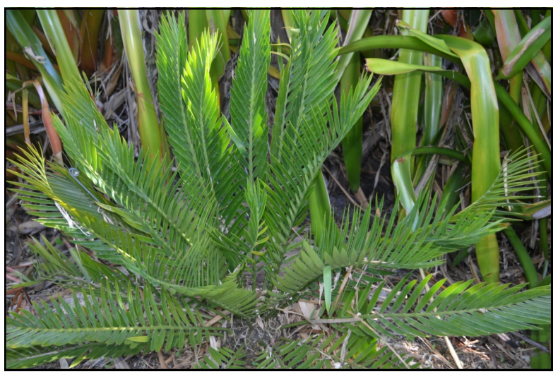
Encephalartos princeps in the Beck garden (six years old).