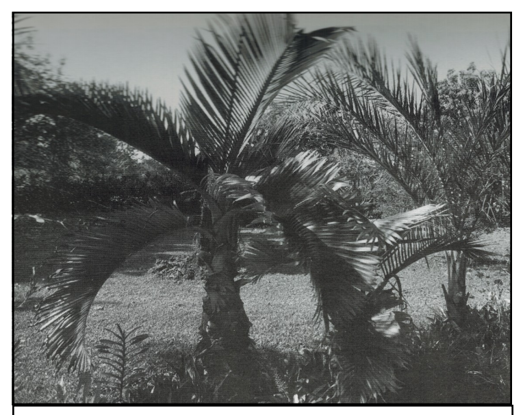
Fig. 5: Hyophorbe lagenicaulis and Pseudophoenix sargentii do their best visually to survive each other's company.