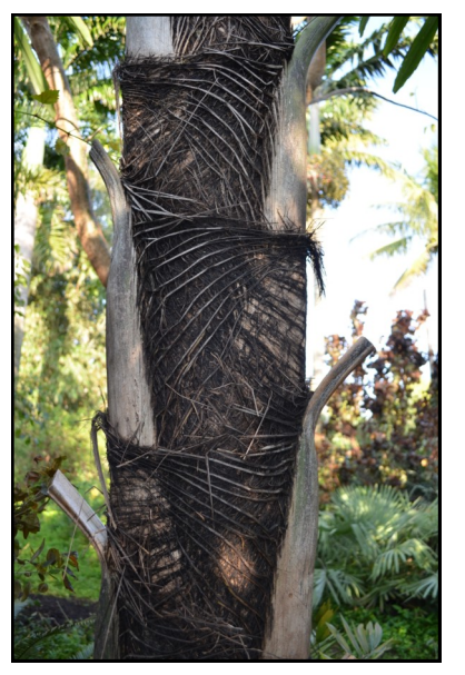
Wallichia disticha stem.

FRONT COVER: Wallichia disticha in the Beck garden.