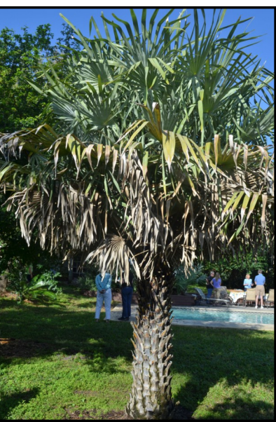
Copernicia prunifer-7 years old