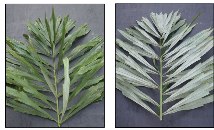
Wallichia disticha topside and underside leaf.