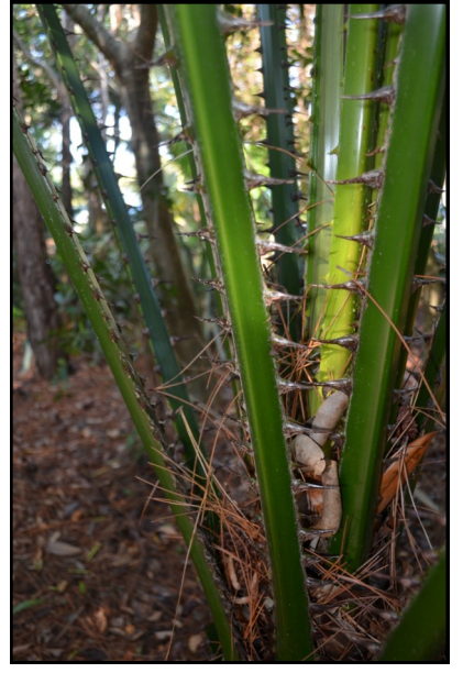
Livistona saribus petioles armed with impressive teeth