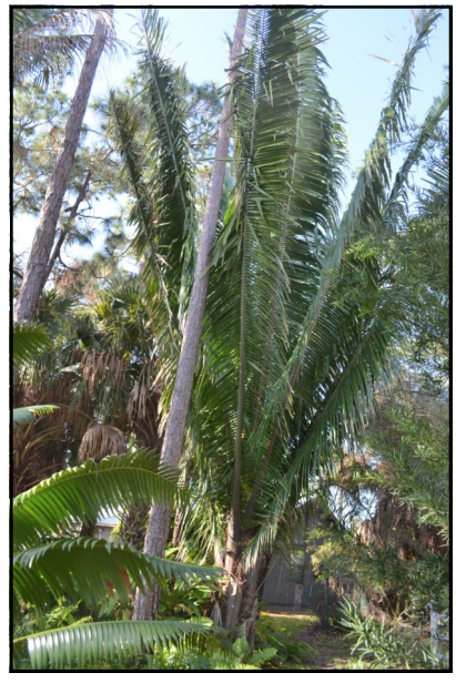
Attalea cohune-12 years old