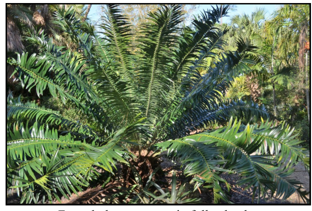
Encephalartos gratus in full splendor

mal and jungle plantings with many towering mature palms and well grown cycads. The garden also contains several water features strategically placed along pathways that added to the calming mood of his garden. I have included a few photos of Don's garden below and on page 11.