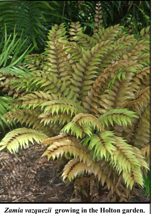
Zamia vazquezii growing in the Holton garden.

tall. In containers, they usually lose their leaves in the winter, but in the ground this usually does not occur. At my house, the plants have never been affected by cold. I usually defoliate my plants in the early spring as they tend to get scale and mealy bug during the dry months. Defoliating the plants also causes them to make a new full head of leaves. When you don't defoliate them, they tend to get too many leaves and new leaves have a difficult time getting through the old leaves.