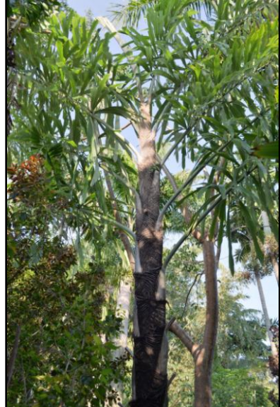
Wallichia disticha in the Beck garden.

Grow this palm for its distinctive disticus growth pattern. The clustered, jagged leaflets and the interesting fibered stem will surely attract admirers. This palm is not commonly available at nurseries but when a seed source is available it can be found.