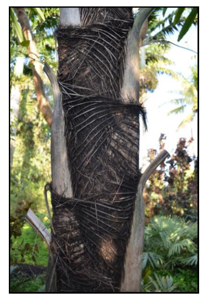
Wallichia disticha stem.