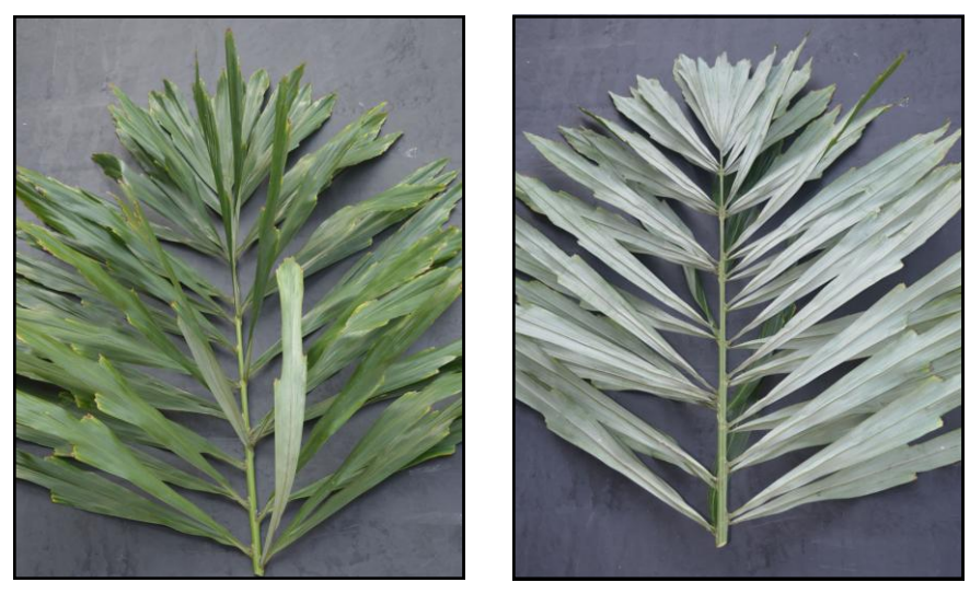
Wallichia disticha topside and underside leaf.