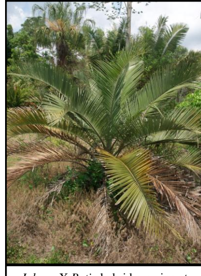
Jubaea X Butia hybrid growing at Mesozoic Landscapes Nursery