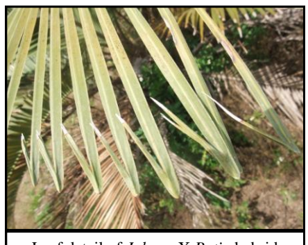
Leaf detail of Jubaea X Butia hybrid growing at Mesozoic Landscapes Nursery