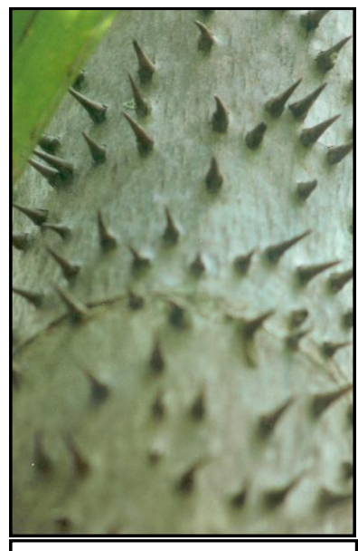
Thorny trunk of Mauritiella sp.