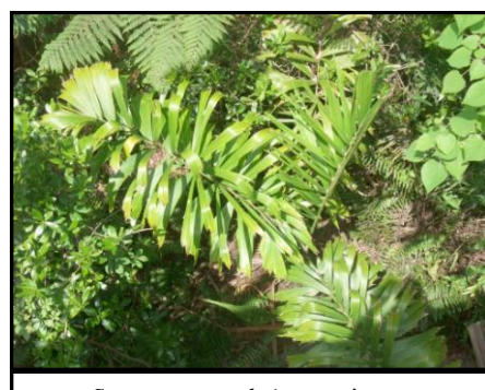
Socratea exorrhzia growing at Mesozoic Landscapes Nursery