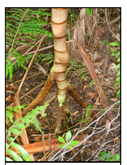
Stilt roots of a Socratea exorrhzia growing at Mesozoic Landscapes Nursery