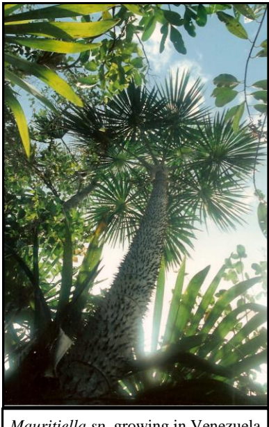
Mauritiella sp. growing in Venezuela