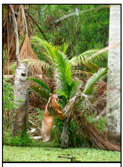
Euterpe oleracea in swamp area