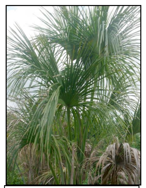
Mauritia flexuosa planted in Richard Moyroud's garden

Mauritia flexuosa is a very large palm with deeply segmented palmate leaves and rounded petioles. In habitat, this dioecious palm grows 15 foot wide leaves on petioles 30 feet long. The stems can