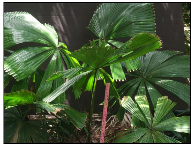
Figure C : Licuala ramsayi specimen growing in Palm Beach County. (yardstick in foreground)