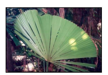
Licuala ramsayi at Mission Bay in Australia