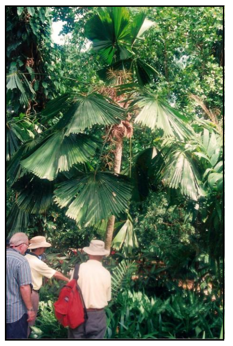
Figure B: Licuala ramsayi at Flecker Botanic Gardens in Australia.