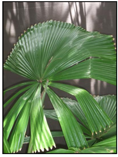
Licuala ramsayi leaf on specimen growing in Palm Beach County.