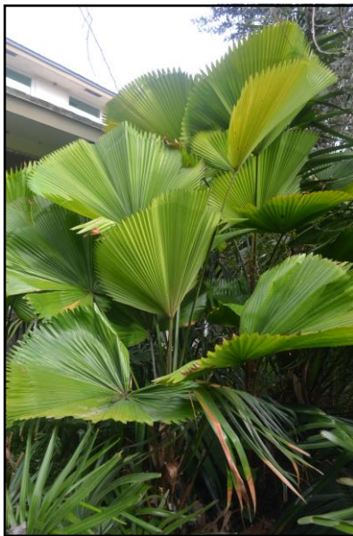
Licuala grandis in full sun at Beck Garden, 12 years old