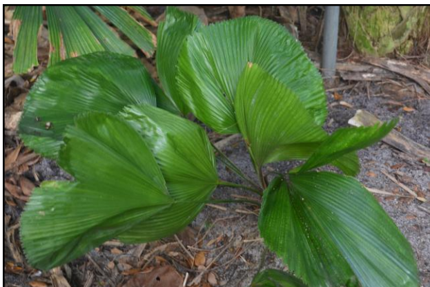
Licuala grandis grown on hardpan mound 2 years old at Beck Garden