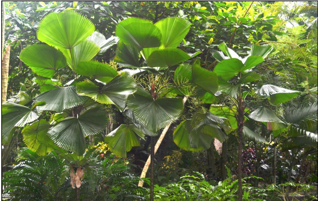
Licuala grandis at Flamingo Gardens, Davie FL