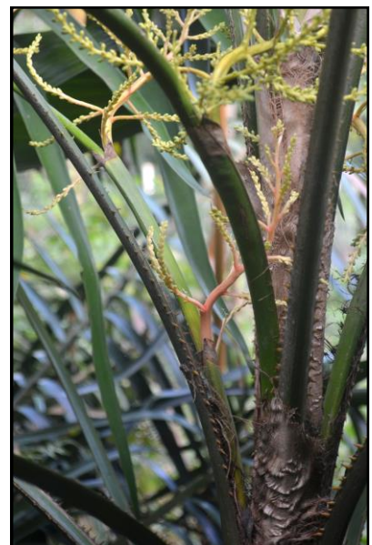
Licuala grandis with salmon colored peduncle at Beck Garden