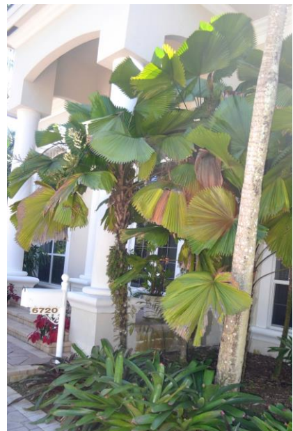
Same palm as shown on left fully recovered in 2016