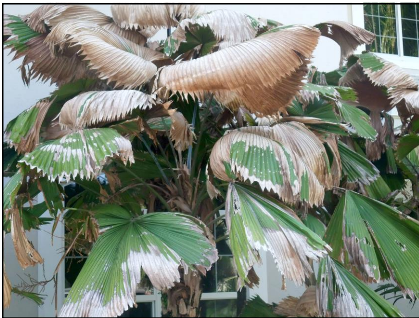
Licuala grandis showing effects of repeated low temperatures in 2010 in Coral Gables, FL