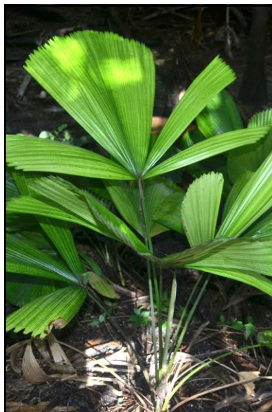
Licuala grandis at Beck Garden Split leaf form, 11 years old