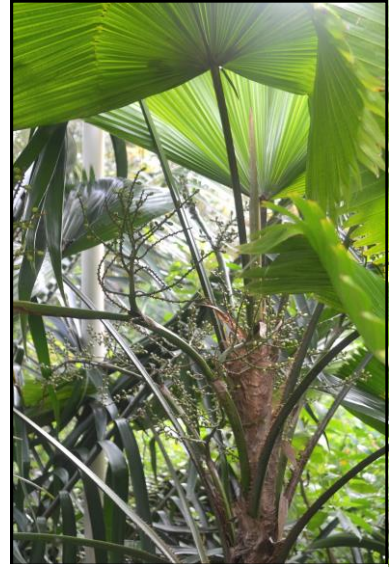
Licuala grandis inflorescence at Beck Garden (12 years old)