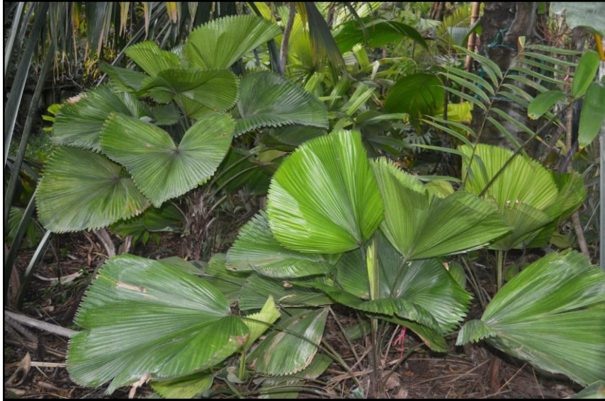
Licuala grandis in heavy shade at Beck Garden 20 years old (left), 7 years old (right)