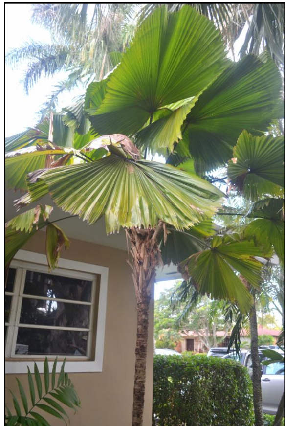
Licuala grandis at Page Garden, Palmetto Bay, FL