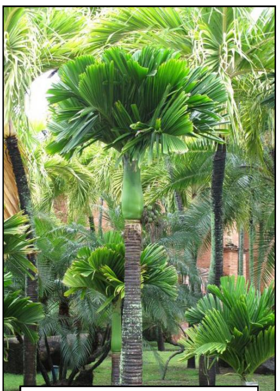
Areca catechu dwarf at Nong Nooch Tropical Garden, photo by Scott Zona courtesy of Palmworld.org