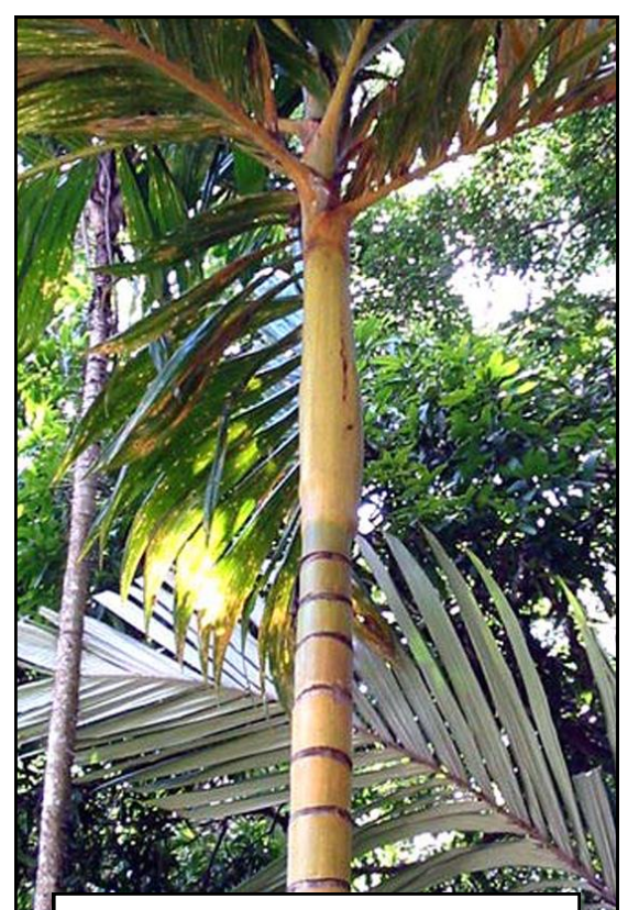
Areca catechu var. alba crownshaft