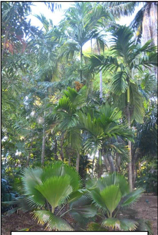
Areca catechu, 10 years old at Fairchild Tropical Botanic Garden