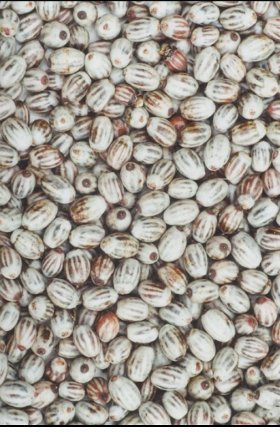
Fig. 3: Hydriastele costata seeds with distinctive striping