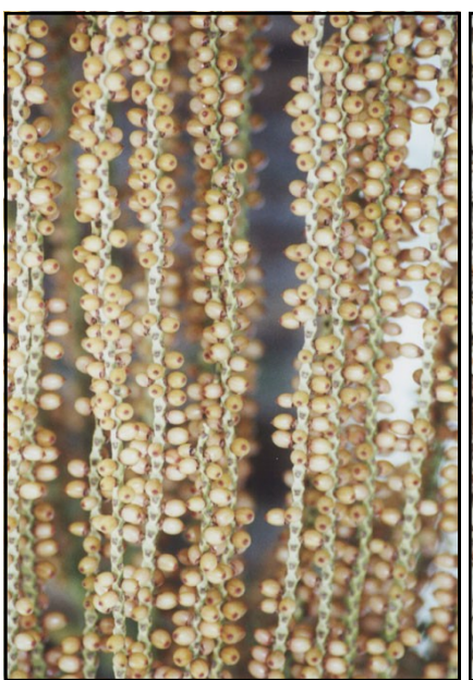
Fig. 2: Hydriastele costata infructescence