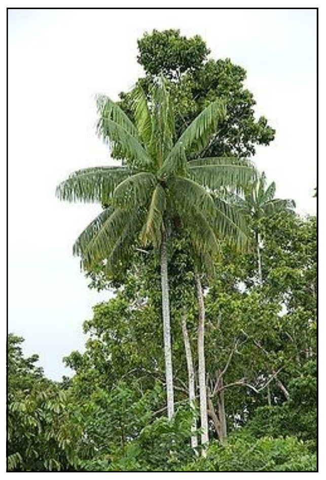
Towards north Biak, Papua, Biak, Indonesia.