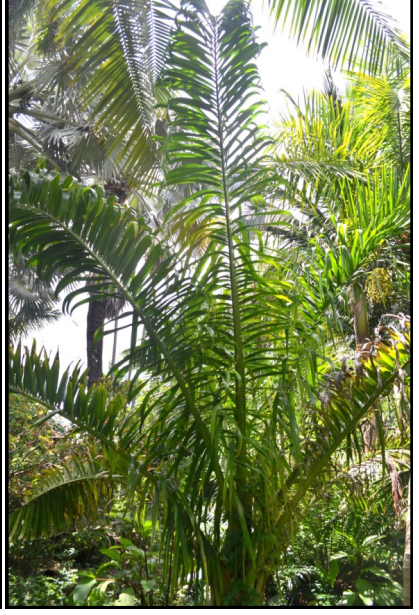
AUCTION PLANT Dypsis prestoniana Medium size Solitary palm with arching fronds Adaptable to full sun exposure (may require supplemental applications of Boron)