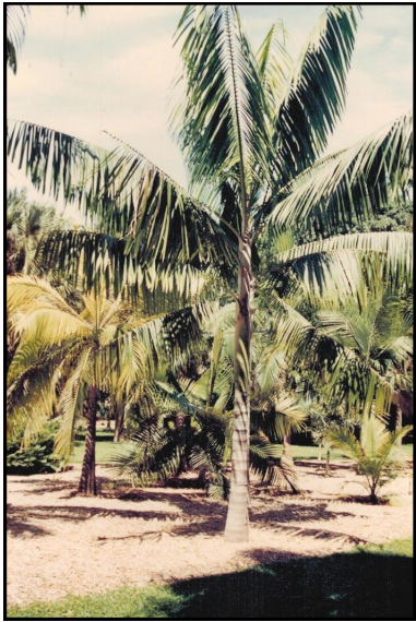
Hydriastele costata at Fairchild Tropical Botanic Garden months prior to 1989 Christmas Freeze