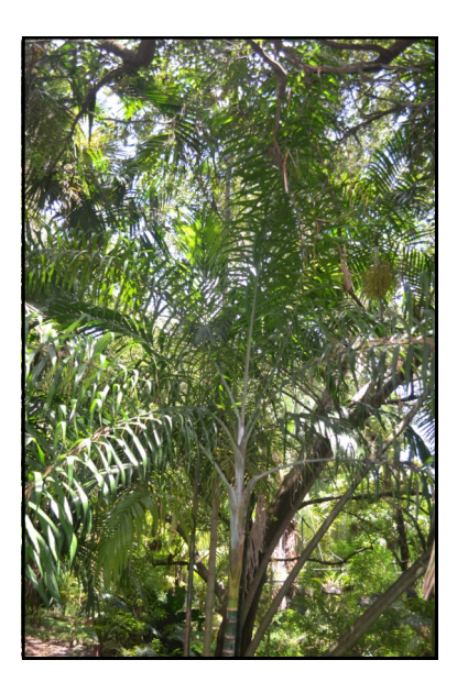
AUCTION PLANT Dypsis basilonga Small size Graceful solitary palm with plumose fronds Best in shade