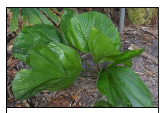
Licuala grandis grown on hardpan mound 2 years old at Beck Garden

I have a hard time identifying a more beautiful, tropical looking palm that grows so easily in