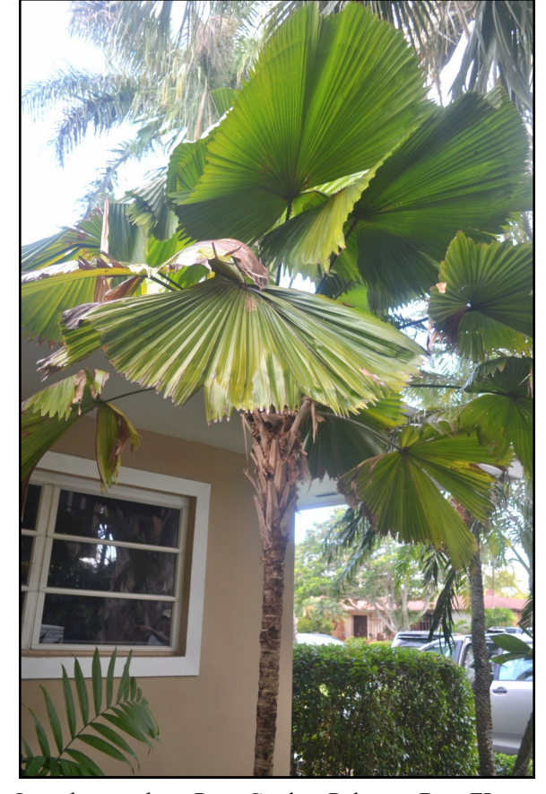
Licuala grandis at Page Garden, Palmetto Bay, FL