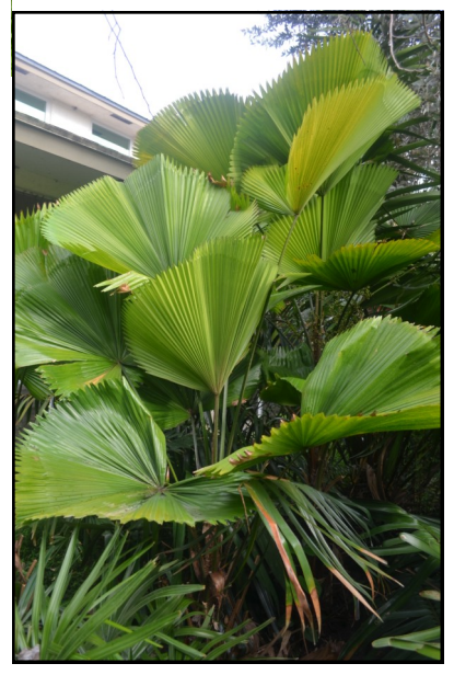
Licuala grandis in full sun at Beck Garden, 12 years old