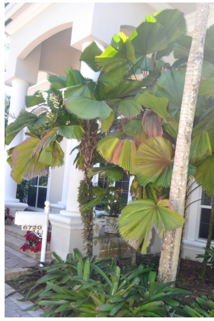
Same palm as shown on left fully recovered in 2016