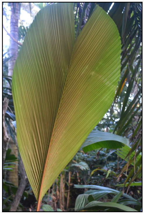
Verschaffeltia splendida Emergent frond In Beck Garden