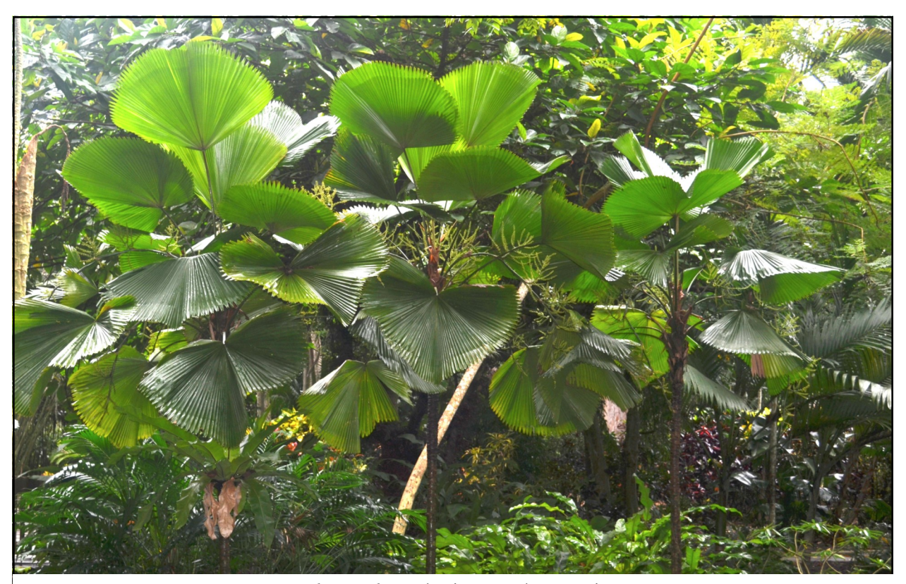
Licuala grandis at Flamingo Gardens, Davie FL