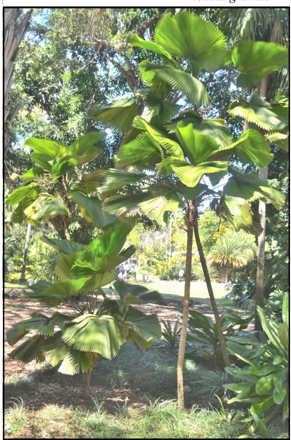
Licuala grandis at Fairchild Garden, Coral Gables, FL