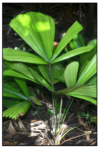
Licuala grandis at Beck Garden Split leaf form, 11 years old