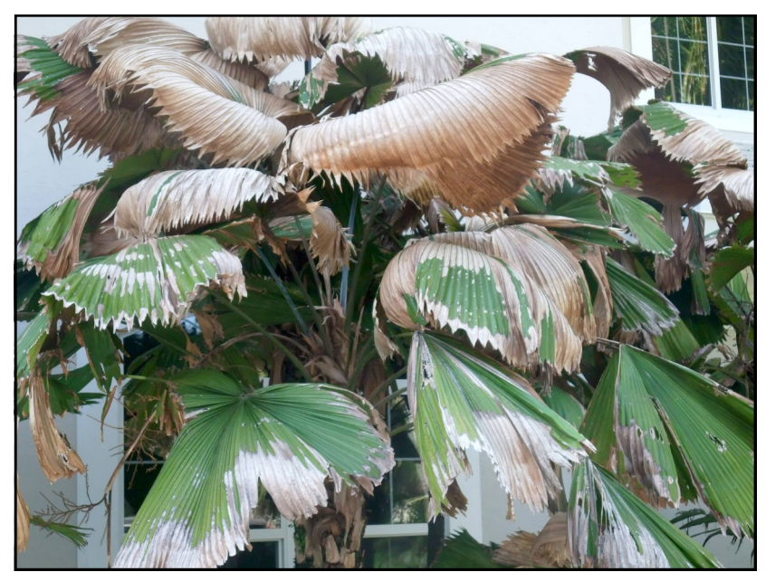
Licuala grandis showing effects of repeated low temperatures in 2010 in Coral Gables, FL