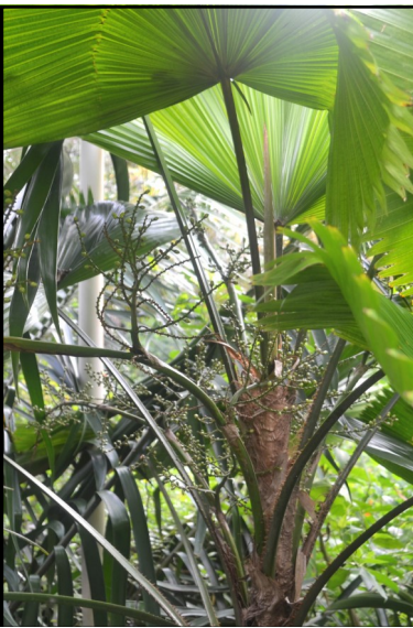
Licuala grandis infructescence at Beck Garden (12 years old)