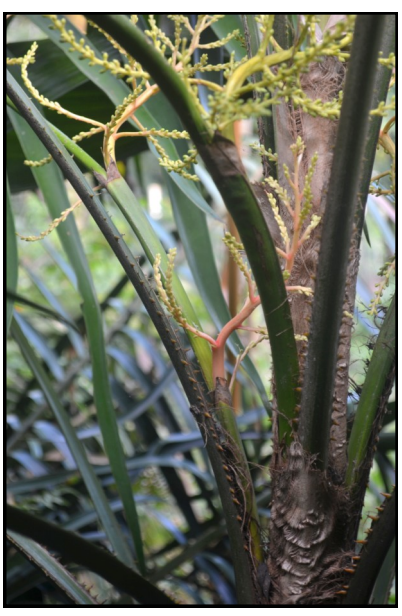
Licuala grandis with salmon colored peduncle at Beck Garden