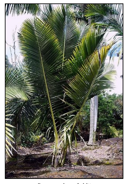
Ravenea dransfieldii at Floribunda Palms, Hawaii