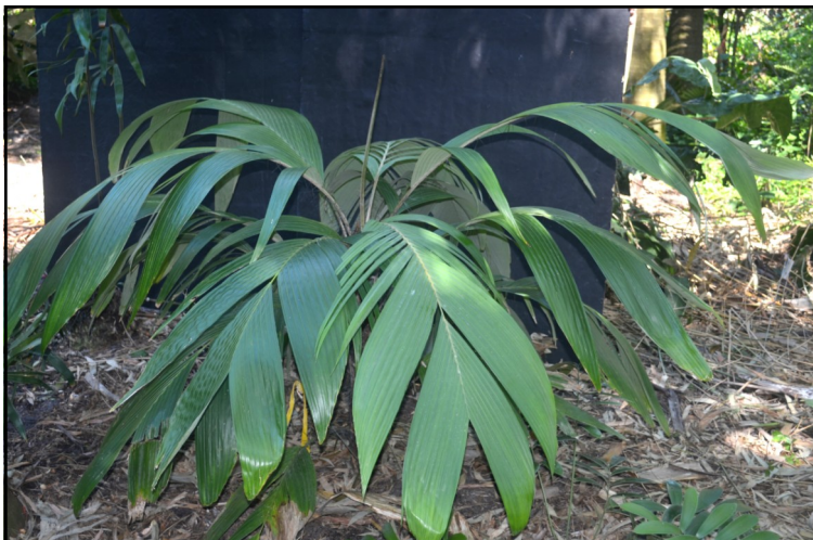
Astrocaryum alatum - 6 years old in the Beck Garden