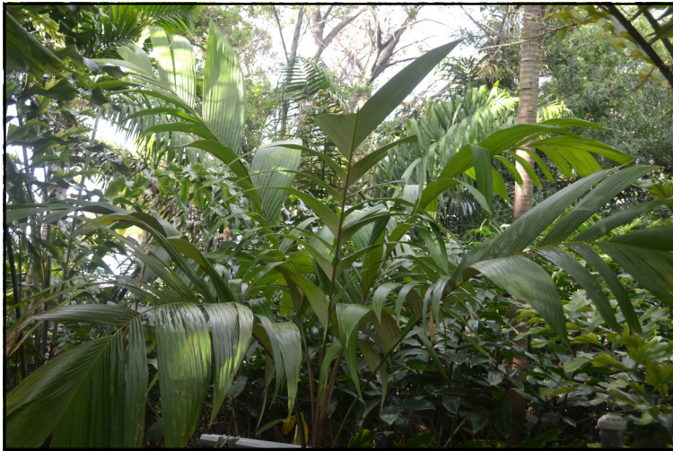
Astrocaryum alatum - 2 years old with 8' long fronds in the Beck Garden