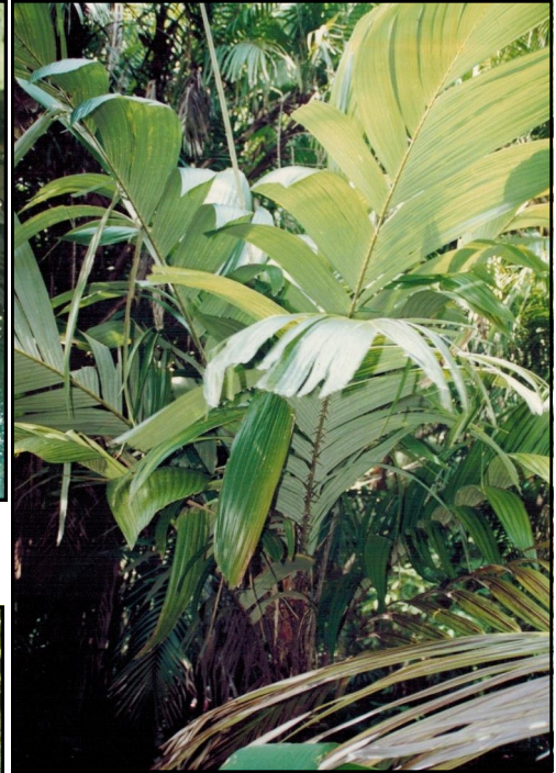
Astrocaryum alatum at FTBG (photo taken 15 years ago current photo on pg.4)