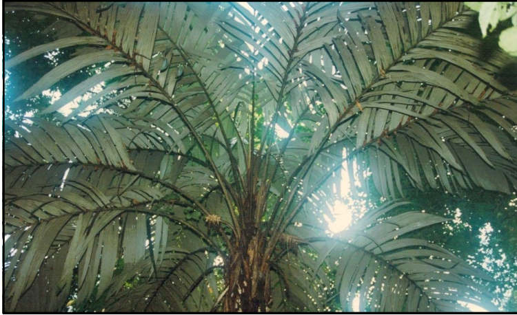
Astrocaryum alatum in habitat, Costa Rica