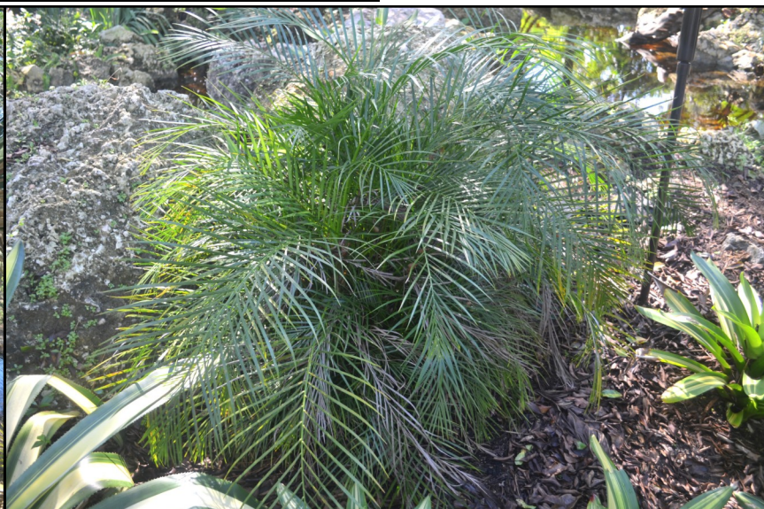
Dwarf Dypsis lutescens