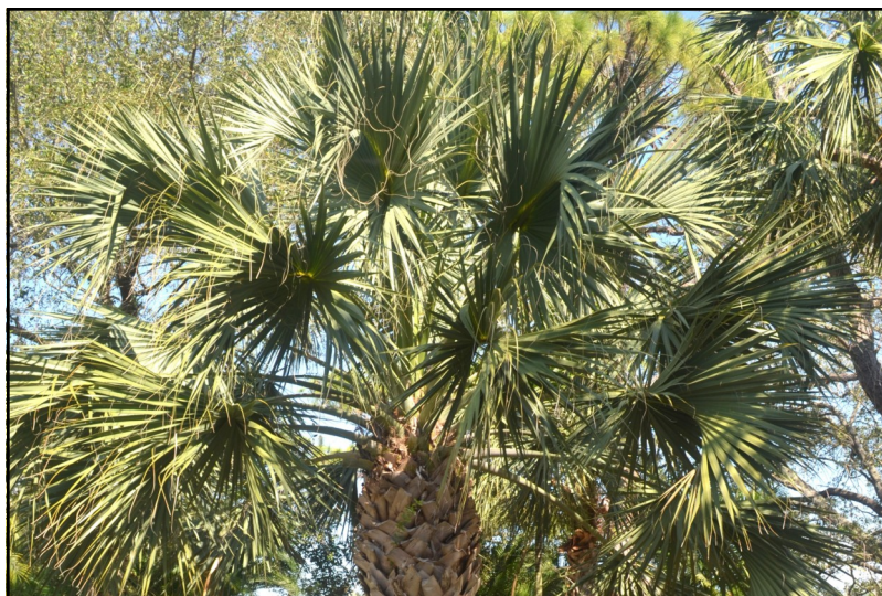
Sabal sp. 'riverside' (left)