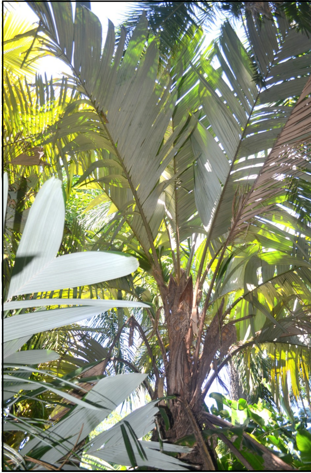
Astrocaryum alatum at FTBG-30 years old