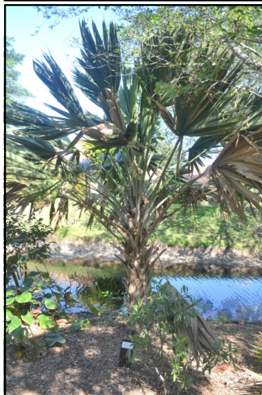
Sabal sp. 'Lisa'