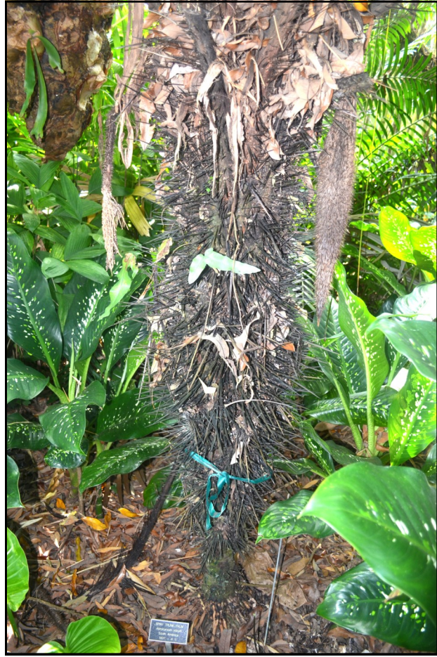
Astrocaryum alatum at FTBG- spiny stem