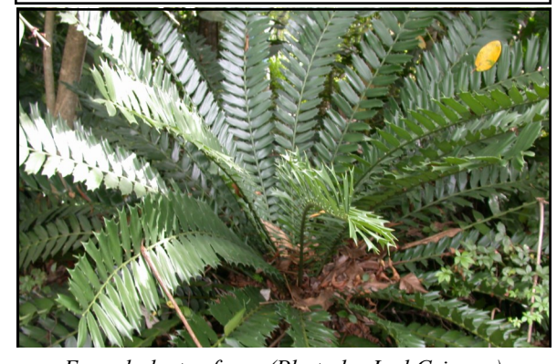
Encephalartos ferox

were dug were Kentiopsis oliviformis, Burretiokentia hapala , and Dypsis cabadae . A magnificent, 7' tall specimen of Licuala ramsayi was moved. This is a palm known for growing in wet situations, so we were all amazed at it surviving so many years without supplemental irrigation.