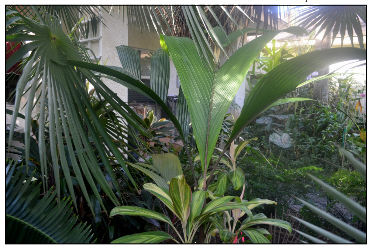
Upper side of frond