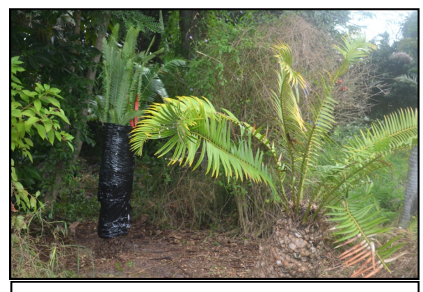
Lucky cycads prior to move to new home

The garden was located on a city lot in Palm Springs. It was a mature garden. I'm sure many of the plants were planted prior to the reestablishment of the PBPSC in 1989. It looked like the garden wasn't fertilized or irrigated for many years. Most of the palms suffered from lack of maintenance, but the cycads looked great. Cycad genera included Zamia, Ceratozamia, Macrozamia, Dioon and Encephalartos. If you want a low maintenance garden, plant cycads. The Mowery garden certainly proved that cycads are tough plants. Once established, they can thrive without any help from humans. Some palms also thrived in these conditions. Syagrus sancona, Satakentia liukiuensis and Elaeis guineensis all looked great but unfortunately were too large to move. Some of the palms that