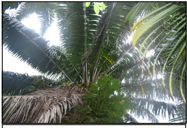
Elaeis guineensis looked fine without fertilizer or irrigation