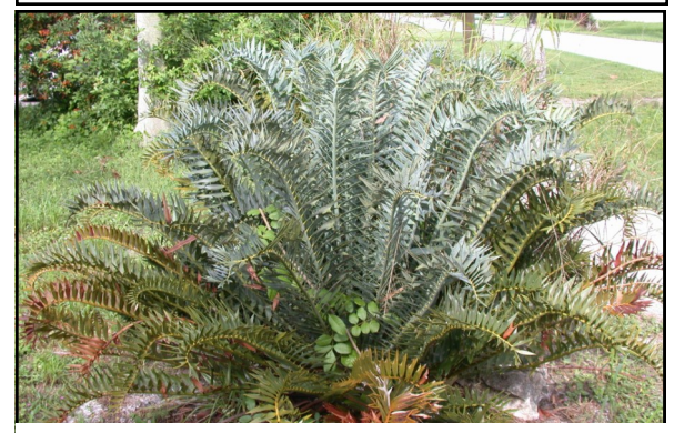
Encephalartos horridus