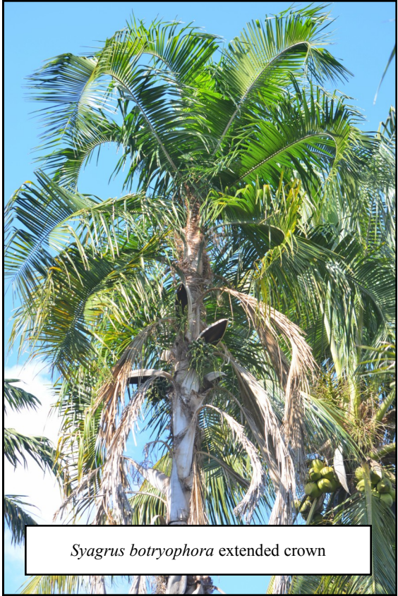
Syagrus botryophora extended crown