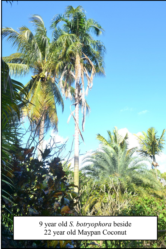
9 year old S. botryophora beside 22 year old Maypan Coconut