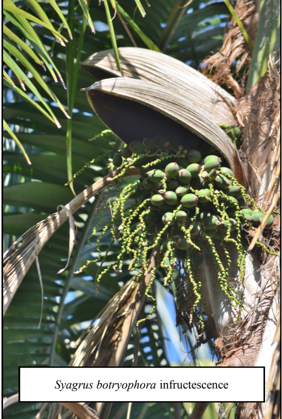
Syagrus botryophora infructescence