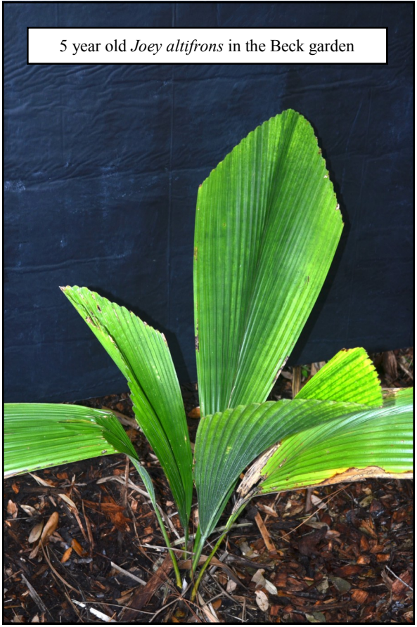
5 year old Joey altifrons in the Beck garden