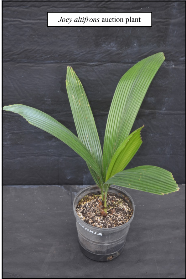
Joey altifrons auction plant