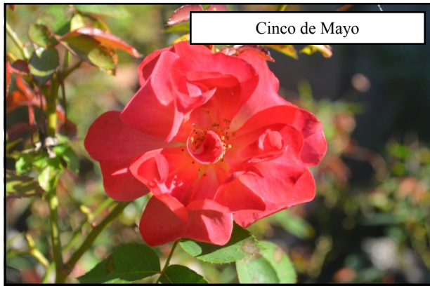
Cinco de Mayo