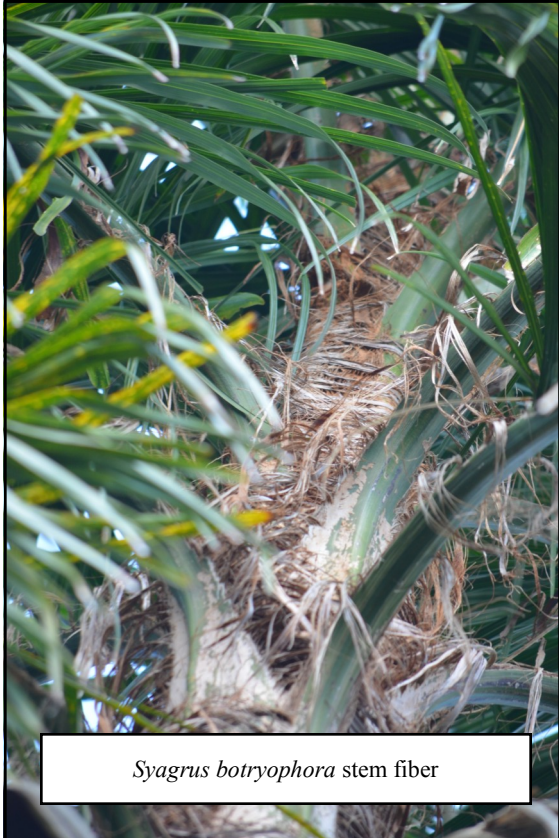
Syagrus botryophora stem fiber