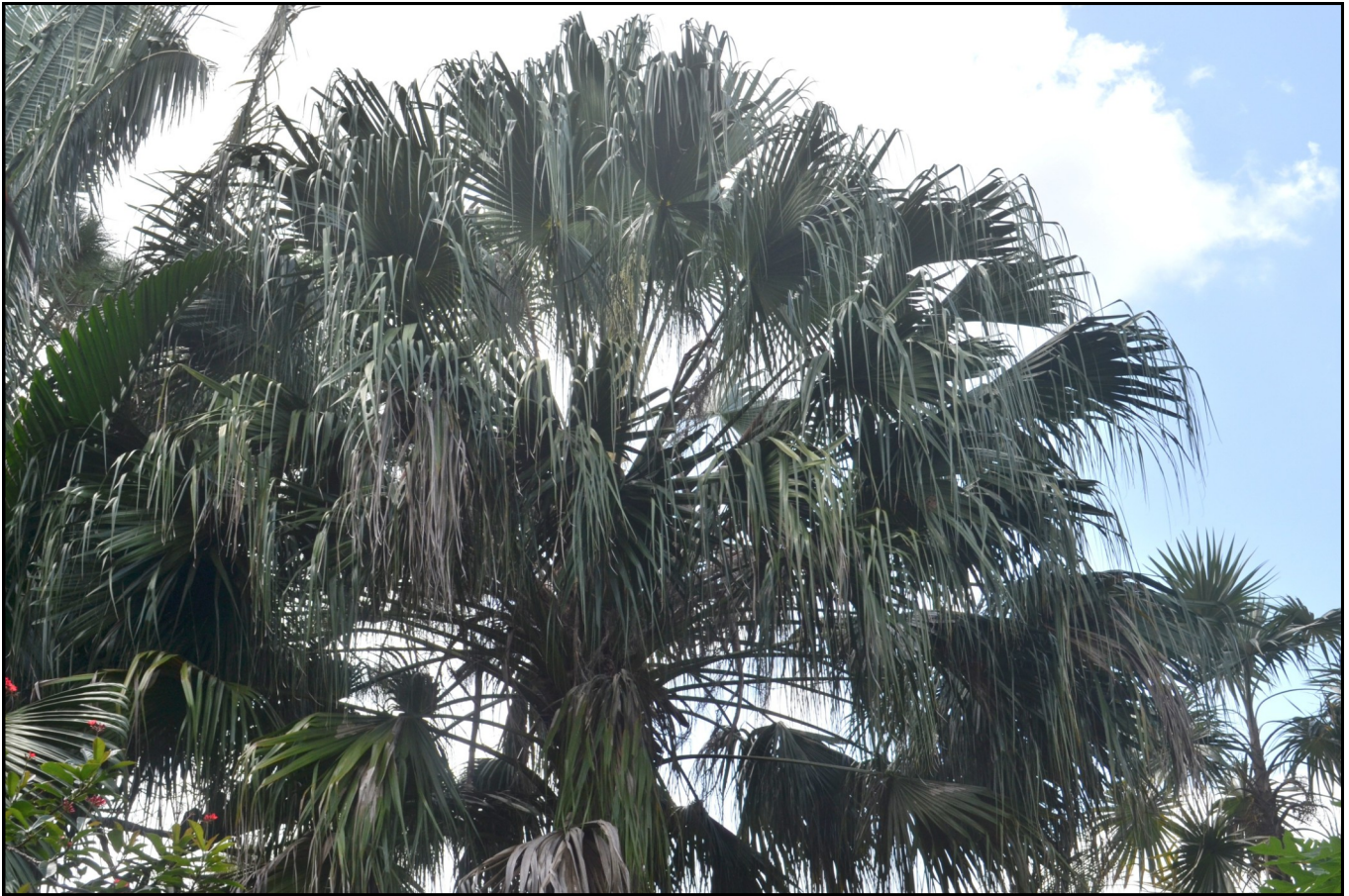
13 year old Livistona australis in the Beck garden