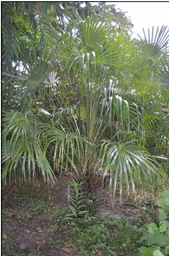
12 year old Livistona australis in the Beck garden