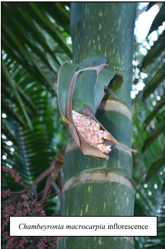
Chambeyronia macrocarpia inflorescence