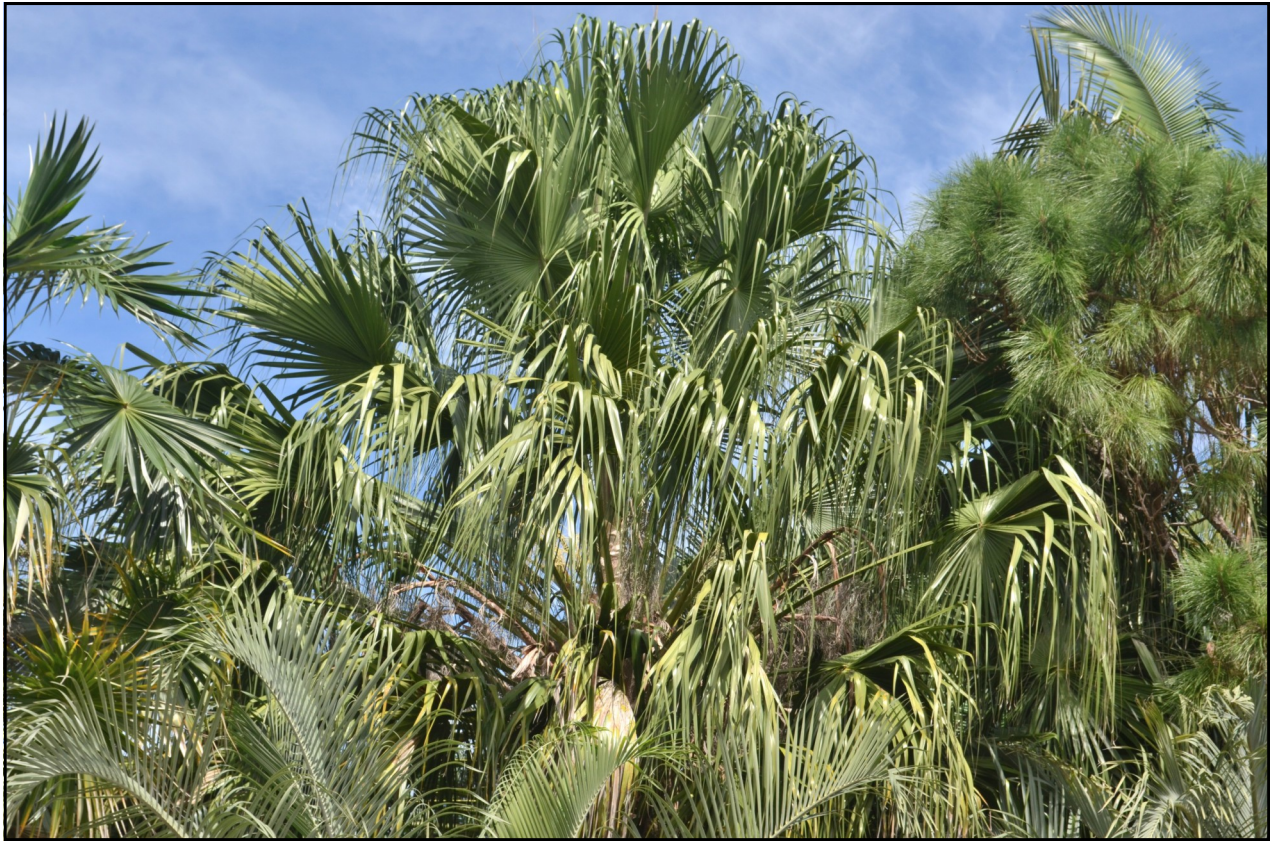
13 year old Livistona australis in the Beck garden