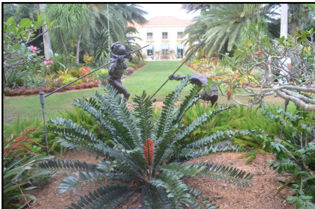
Encephalartos ferox French Tour at Eigelberger Estate