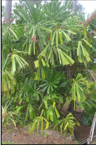
Licuala spinosa at Caribbean Palms Nursery