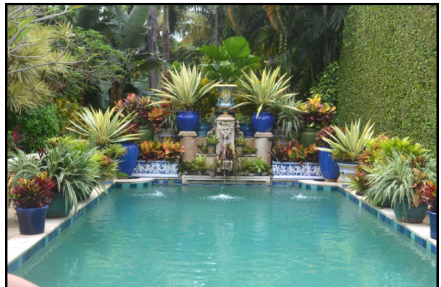
Poolside French Tour at Eigelberger Estate