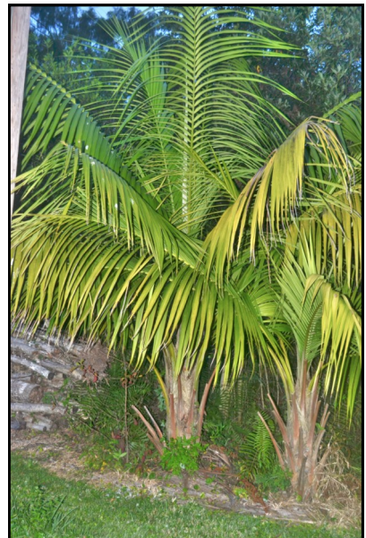
Calptronoma rivalis at Mezoic Landscapes

Opinions expressed and products or recommendations published in this newsletter may not be the opinions or recommendations of the Palm Beach Palm & Cycad Society or its board of directors.