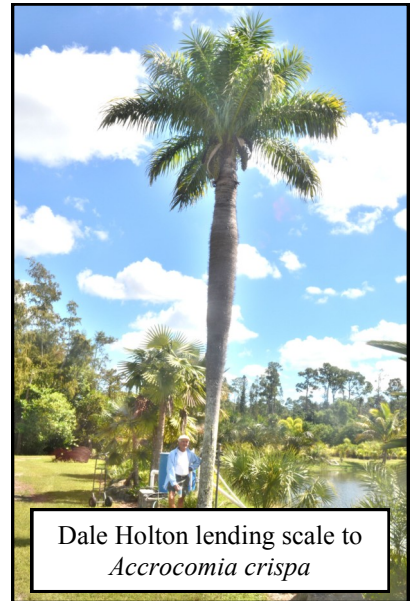
Dale Holton lending scale to Accrocomia crispa