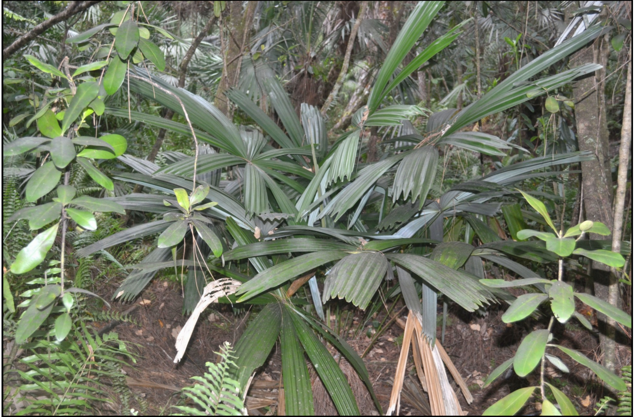
Itaya amicorum at Mezoic Landscapes