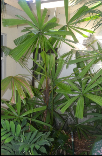
Licuala spinosa at the Beck Garden