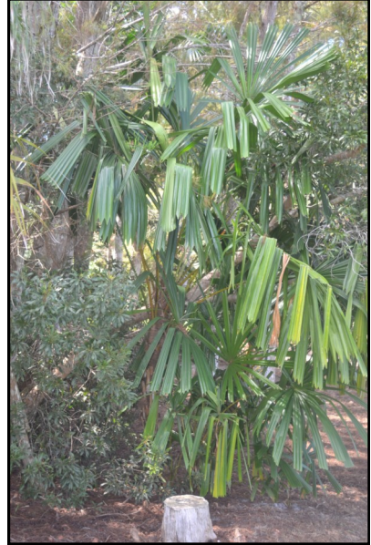
Licuala spinosa at Holton Nursery