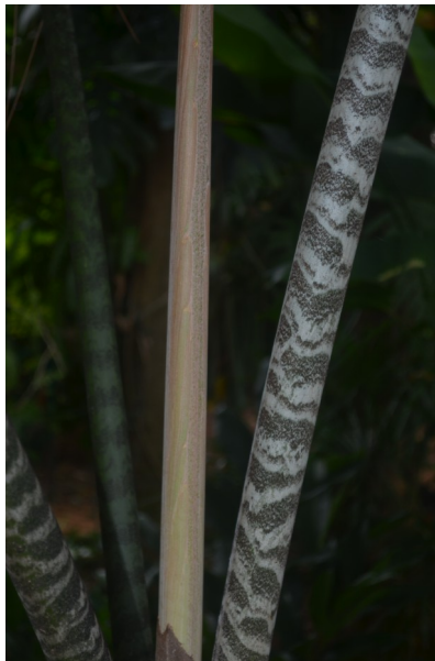
Caryota zebrena petiole in the Wilburn Garden