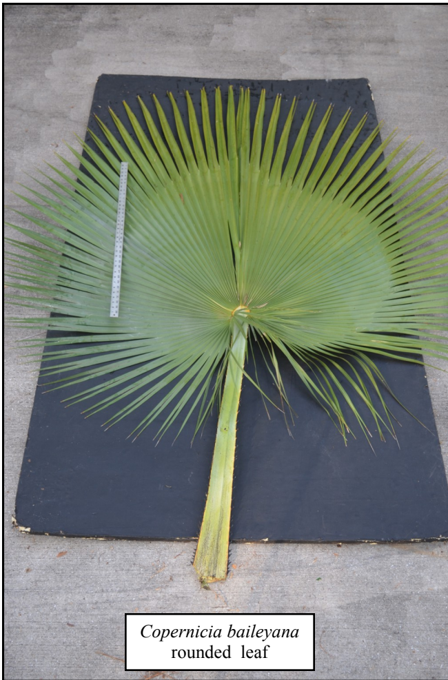
Copernicia baileyana rounded leaf