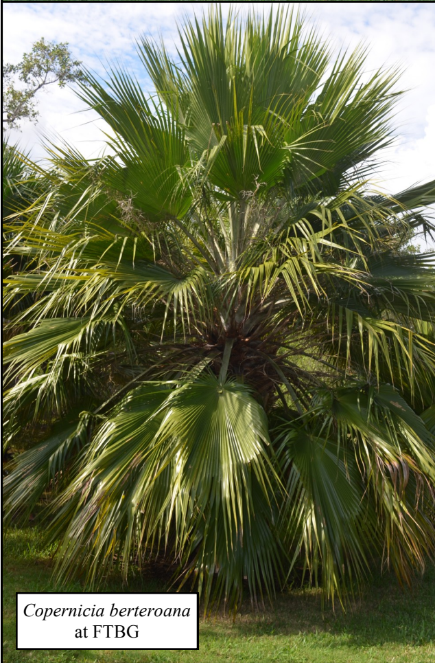
Copernicia berteroa at FTBG