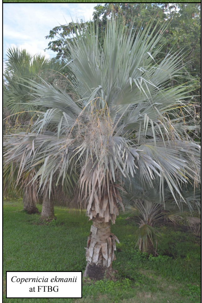
Copernicia ekmanii at FTBG