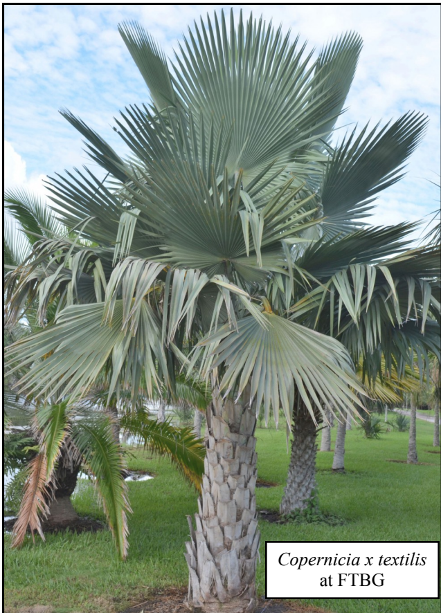
Copernicia x textilis at FTBG