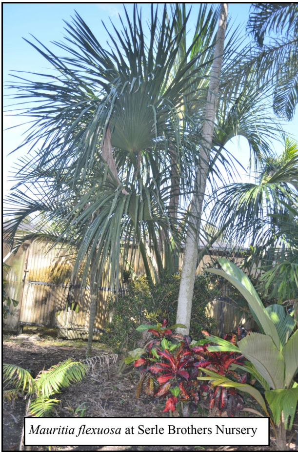
Mauritia flexuosa at Serle Brothers Nursery