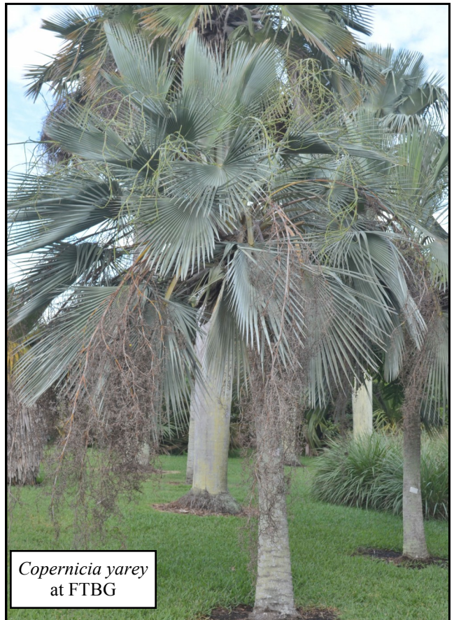
Copernicia yarey at FTBG