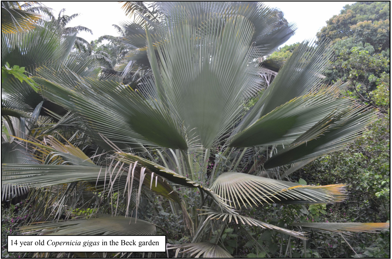
14 year old Copernicia gigas in the Beck garden