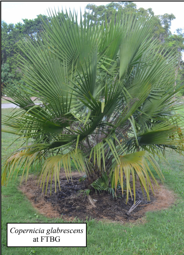
Copernicia glabrescens at FTBG