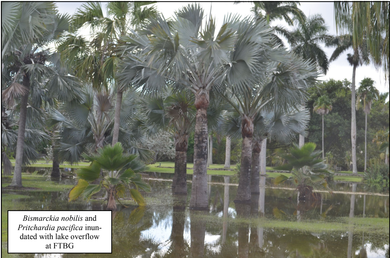
Bismarckia nobilis and Pritchardia pacifica inundated with lake overflow at FTBG

Opinions expressed and products or recommendations published in this newsletter may not be the opinions or recommendations of the Palm Beach Palm & Cycad Society or its board of directors.