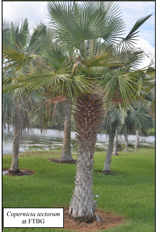
Copernicia tectorum at FTBG