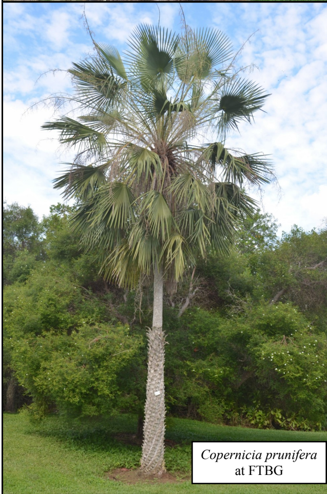
Copernicia prunifera at FTBG