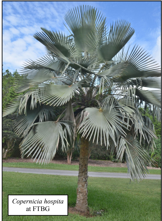
Copernicia hospita at FTBG