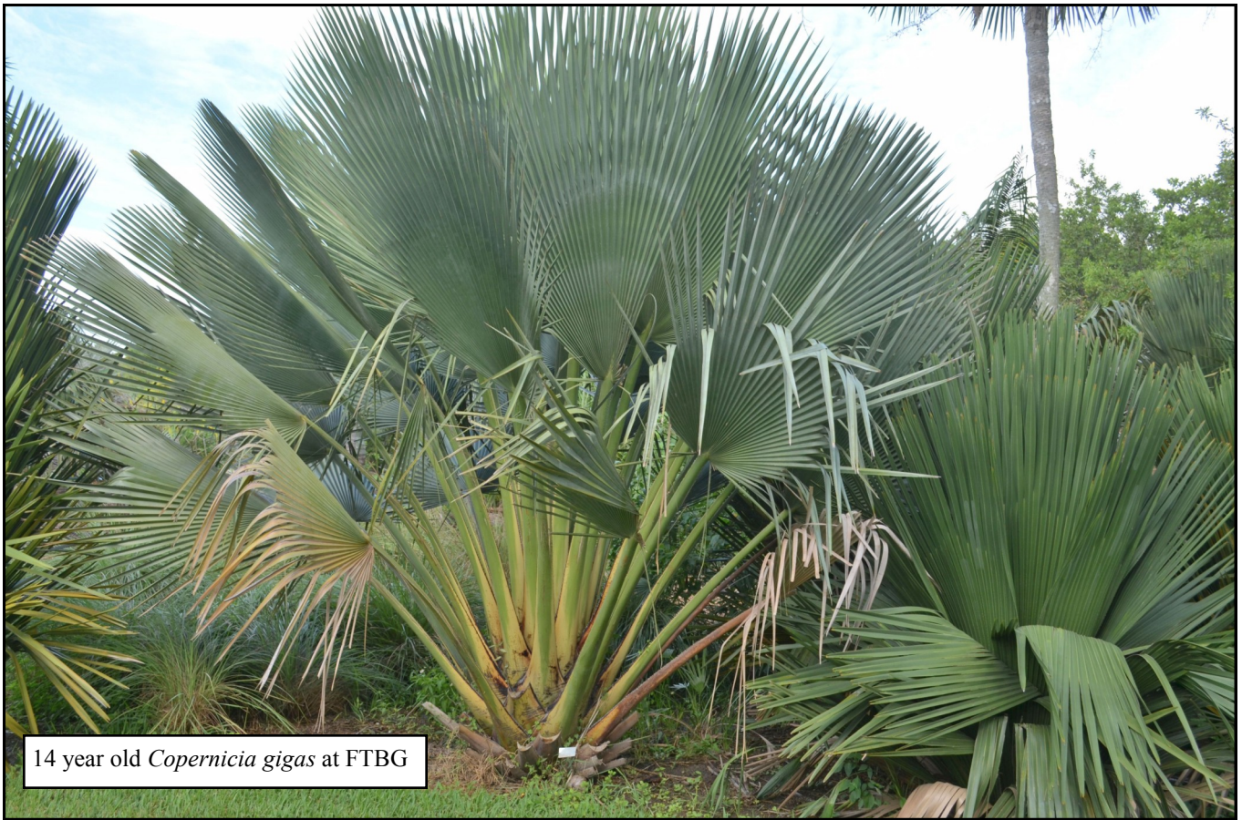
14 year old Copernicia gigas at FTBG