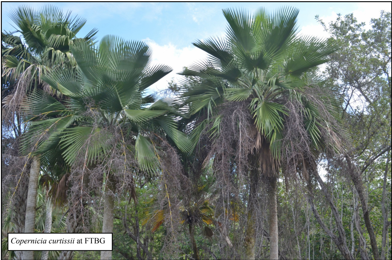
Copernicia curtissii at FTBG