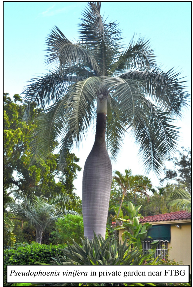
Pseudophoenix vinifera in private garden near FTBG