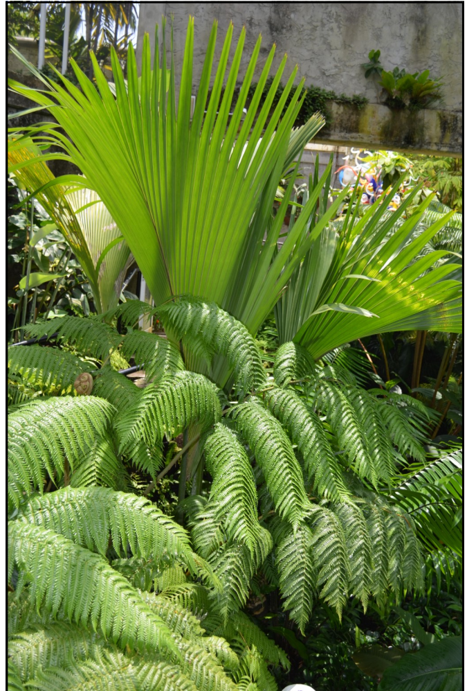
Lodoicea maldivica (double coconut)