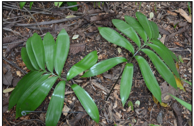
Zamia splendens typical sized plant