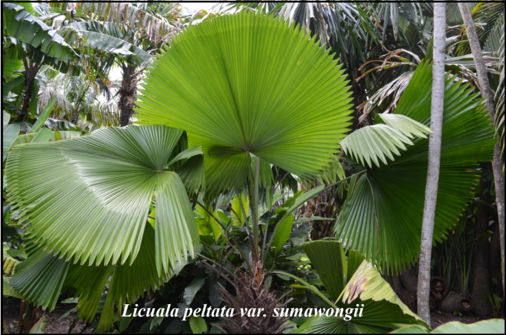
Licuala peltata var. sumawongii