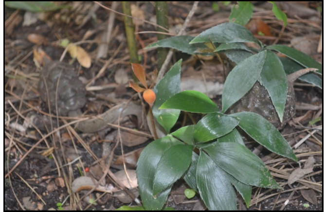
Zamia splendens seedlings beneath mother plant in the Beck garden.