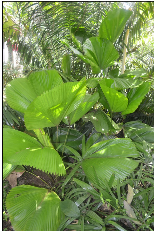
Group of Licuala grandis