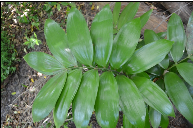
Zamia splendens leaf detail