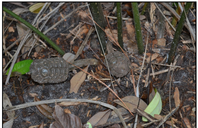
Zamia splendens female cone