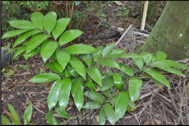
Zamia splendens with multiple offshoots