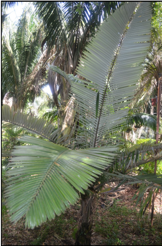
Allagoptera caudescens (formerly Polyandrocos caudescens )