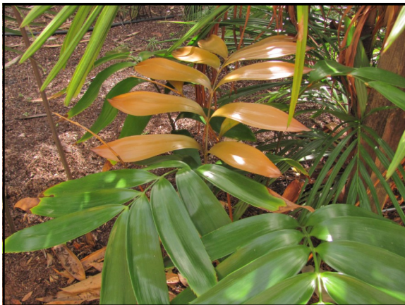
Zamia splendens with new growth growing in Dale Holton's garden.