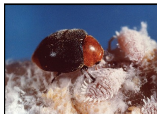
Adult Australian Lady Beetle ( Crptolaemus Montrouzieri )