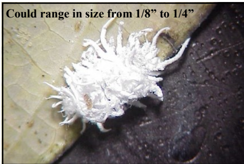
Crptolaemus montrouzieri Beneficial insect

If you notice what looks like giant mealybugs in your garden, DO NOT spray with insecticide. These are the larval form of a black lady beetle ( Crptolaemus montrouzieri ), native to Australia. The larvae are named mealybug destroyers. These beneficial insects love to eat aphids, mealybugs and scale, especially croton scale. I've seen these all over my crotons eating the scale. They can also be found on the lower surface of palm leaflets devouring scale and whitefly larvae. They look so much like mealybugs, they are easily confused. They also consume honeydew which is excreted from scale and other sucking pests. This honeydew is what causes the black mold found on scale and whitefly infested plants. These beneficial insects can be purchased online but my mealybug destroyers arrived naturally. If you stop spraying insecticides or applying Imidacloprid, they should show up in your garden all by themselves.