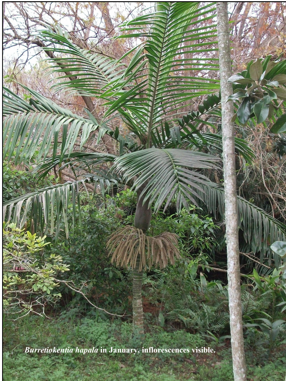
Burretiokentia hapala in January, inflorescences visible.