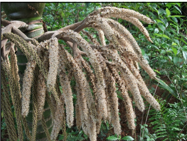
Half the open flowers have fallen off in night temps in the 40s. Unopened flowers (left) are OK.