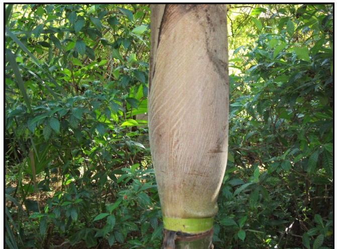
Faintly striped crownshaft of the palm.