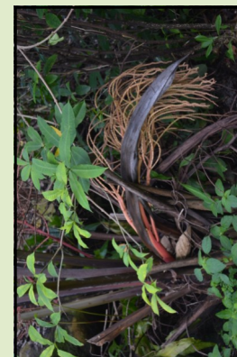
Mystery palm inflorescence