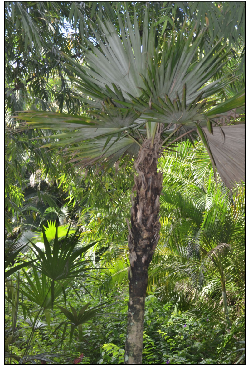
Short petiole Coccothrinax sp.