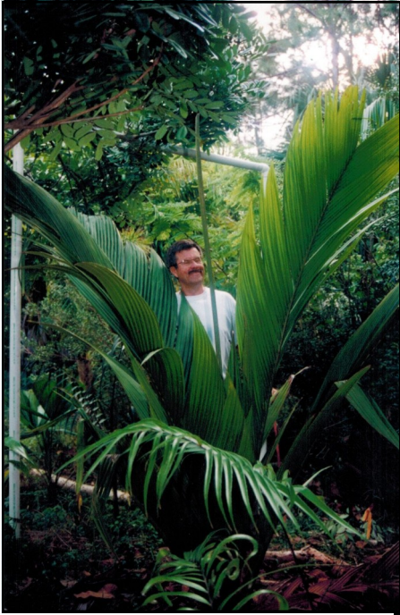
LEFT: Marojejya darianii growing in the Beck garden.