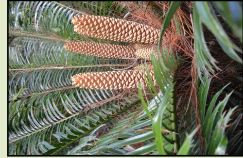
Encephalartos hildebrandtii male cones