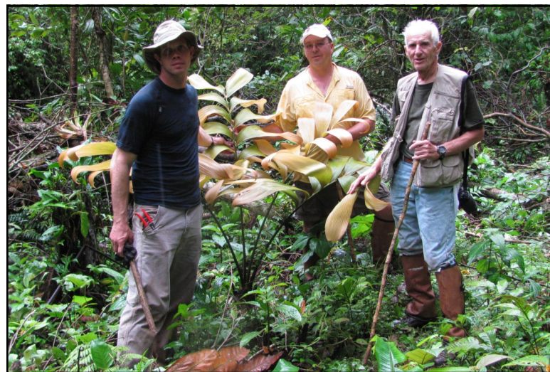
FRONT COVER: Zamia imperialis growing in the Holton Garden.