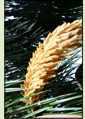
Attalea sp. Inflorescence