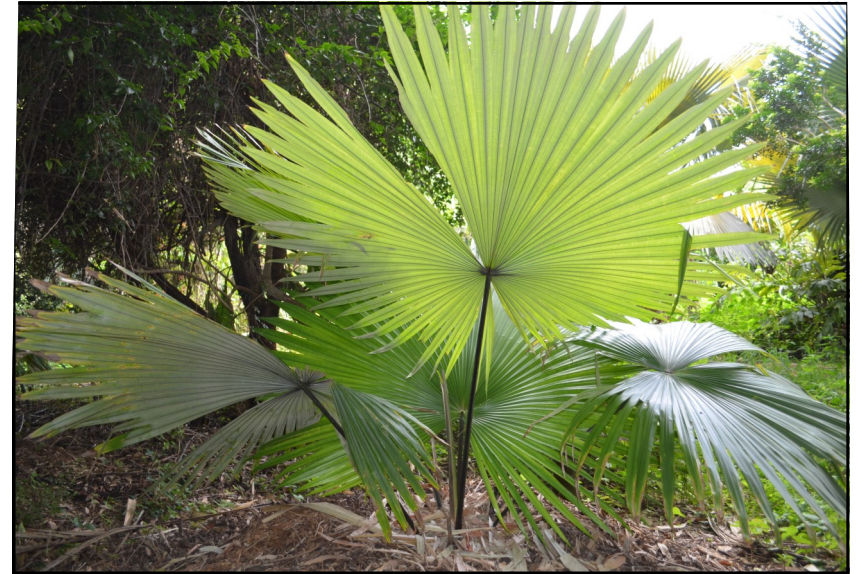
ABOVE AND BELOW: 18 year old K. elegans growing in the Beck garden.