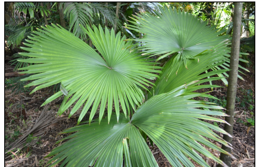
FRONT COVER: K. elegans at Fairchild Tropical Botanical Garden.