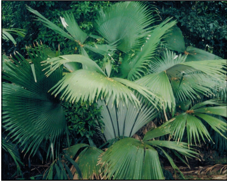
ABOVE: K. elegans growing in Townsville Palmetum, Townsville, Australia BELOW: K. elegans growing in Norm Moody's garden.