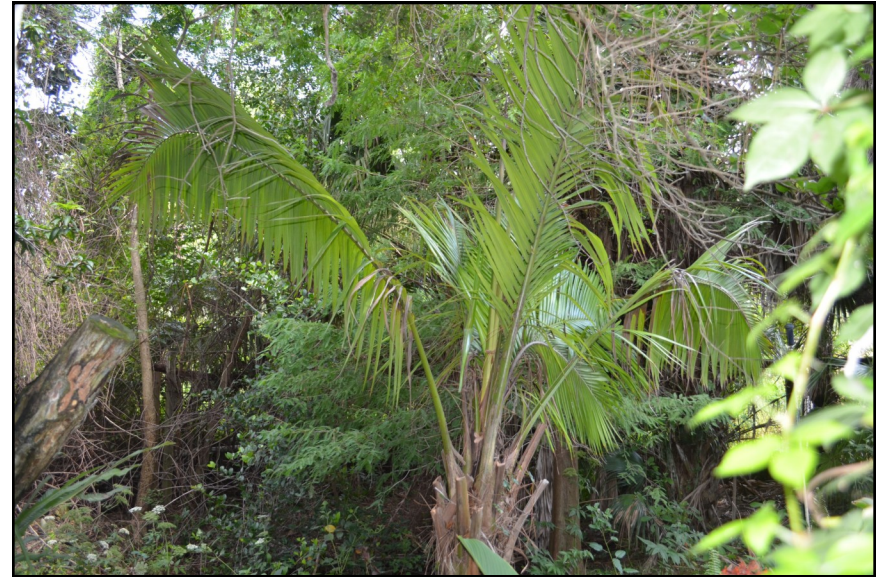
Calyptrotonoma plumeriana recovering from boron deficiency