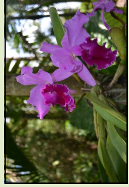
Cattleya orchid growing on Psychosperma elegans