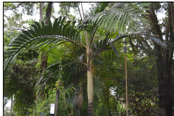
Chambeyronia macrocarpa 'hookeri'