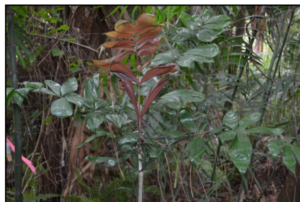
Dypsis sp. 'pink crownshaft'