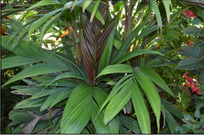
Calypstrocalyx hollrugii (above) and Calypstrocalyx leptostachys (below) growing in the Beck garden.