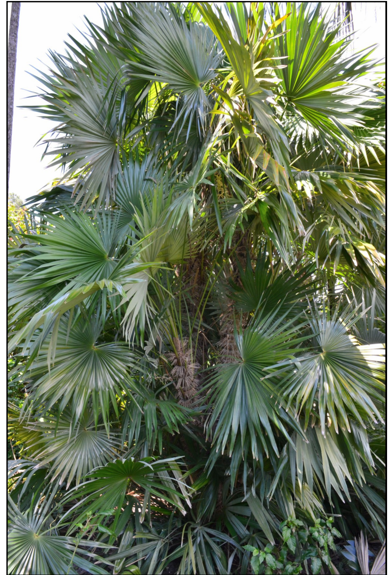
Nineteen year old Zombia antillarum growing in the Beck garden.

FRONT COVER: Showy stems of Zombia antillarum