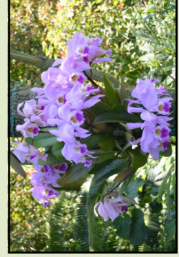
Cattleya gaskelliana orchid growing on Veitchia stem