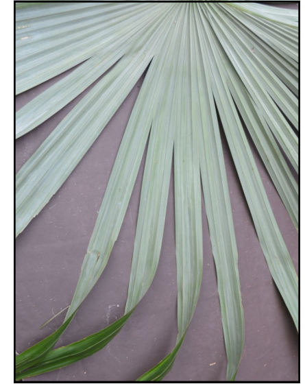
S. mauritiformis leaf segments divided into fours