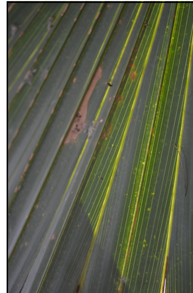
S. domingensis leaf detail with no transverse veins