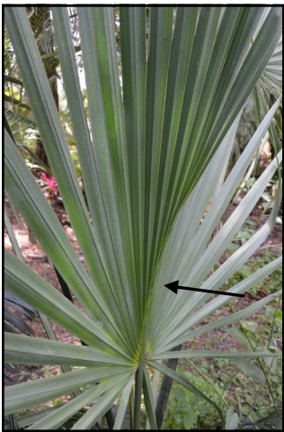
RIGHT: Strongly costapalmate leaf of S. etonia