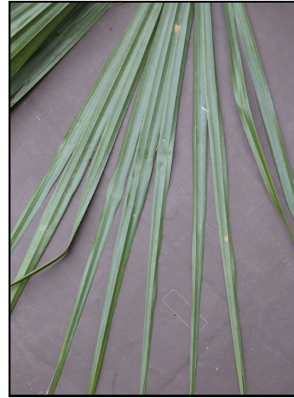
S. yapa leaf segments divided into twos and threes