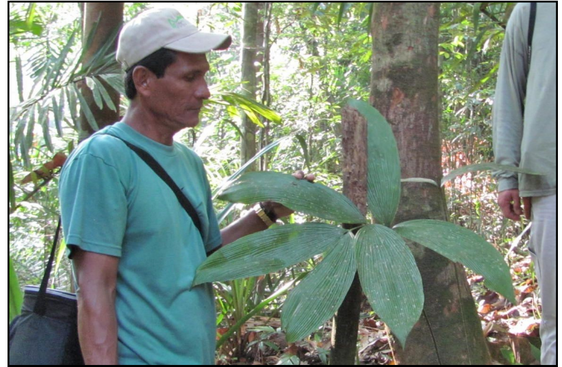
ABOVE AND BELOW: Zamia dressleri growing in habitat.