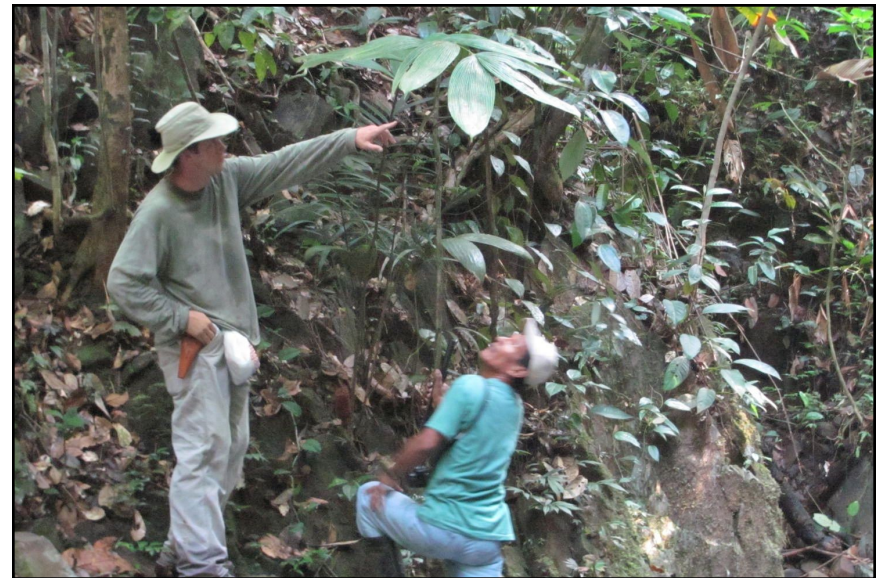
FRONT COVER: Zamia dressleri