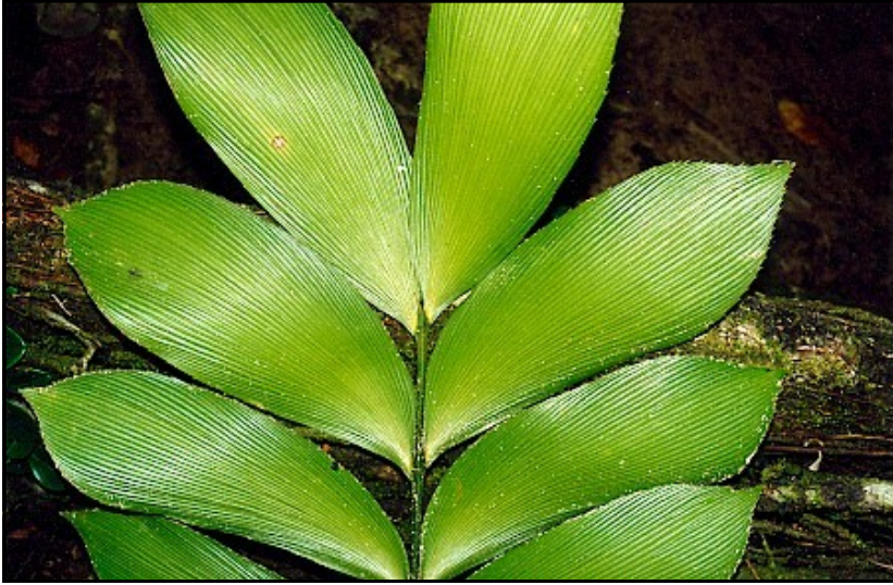
ABOVE AND BOTTOM RIGHT: Photographs of Zamia dressleri growing in the Panamian rainforest.