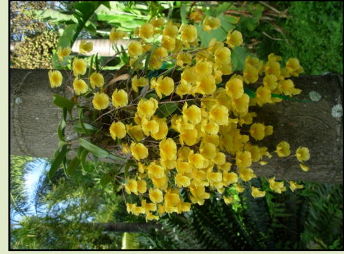
Dendrobium sp. Orchid growing on Dyopsis leptocheilos in the Beck garden.

Palm Beach Palm & Cycad Society P.O. Box 21-2228 Royal Palm Beach, FL 33421