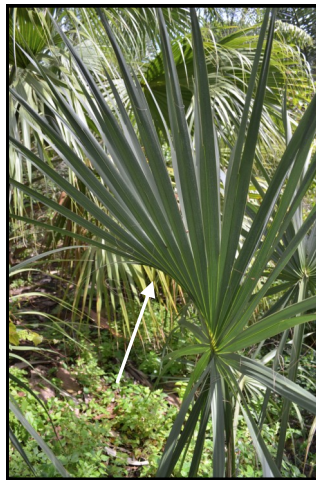
LEFT: Weakly costapalmate leaf of S. uresana