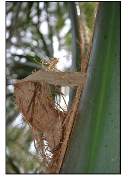
S. domingensis with incomplete ligule at leaf base