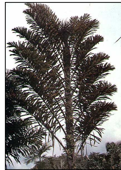
Wallichia disticha at the Townsville Palmetum in Australia.