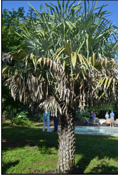
Copernicia prunifer —7 years old