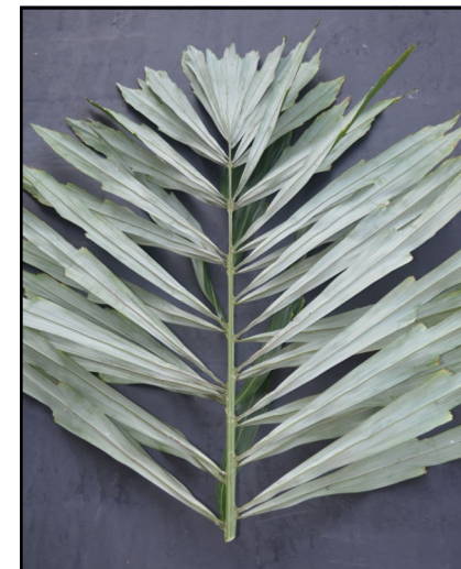
Wallichia disticha topside and underside leaf.