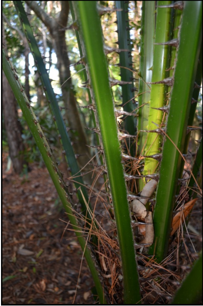
Livistona saribus petioles armed with impressive teeth