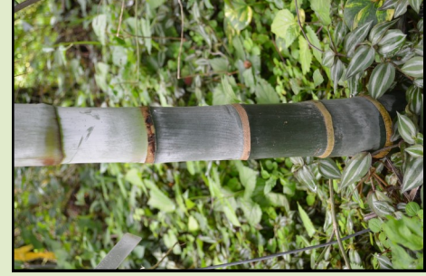
Dypsis sp. "mayotte" attractive stem coloration