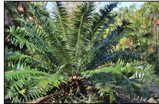
Encephalartos gratus in full splendor

mal and jungle plantings with many towering mature palms and well grown cycads. The garden also contains several water features strategically placed along pathways that added to the calming mood of his garden. I have included a few photos of Don's garden below and on page 11.