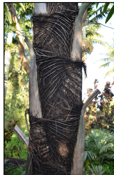
Wallichia disticha stem.