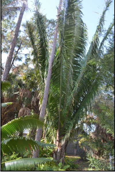
Attalea cohune —12 years old