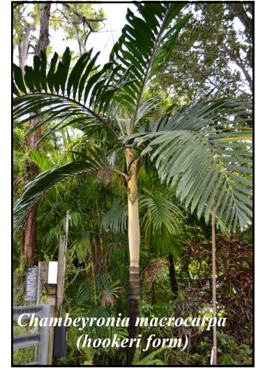
Chambeyronia macrocarpa (hookeri form)

FRONT COVER: Coccothrinax borhidiana (left and top right) growing in habitat and (bottom right) growing in the Holton garden.