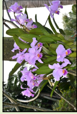
Cattleya trianae growing on a Veitchia sp. In the Beck garden.