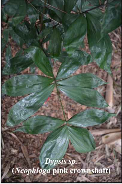
Dypsis sp. ( Neophloga pink crownshaft)