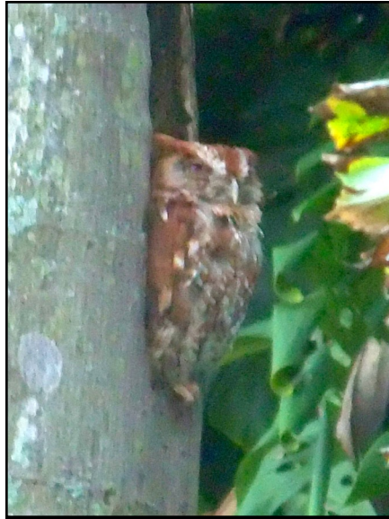
A screech owl that nests on the property checking out all the noisy Palm Society tourists.

When asked to share some words of wisdom, Norm stated that you should plant four or five of one species since you are bound to lose some. In addition, he recommended protecting palms from cold weather by wrapping the trunks and crown with frost protecting fabric during cold snaps. He also recommended placing more cold sensitive palms in