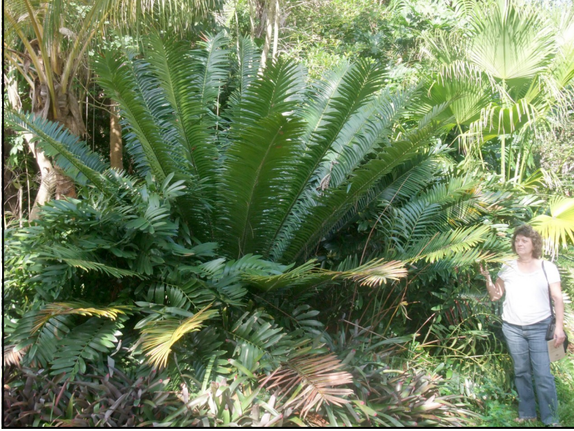
Encephalartos kisambo (above) and Roscheria melanochaetes (below) growing in the Moody garden.