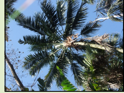
Howea forsteriana growing in the Moody garden.