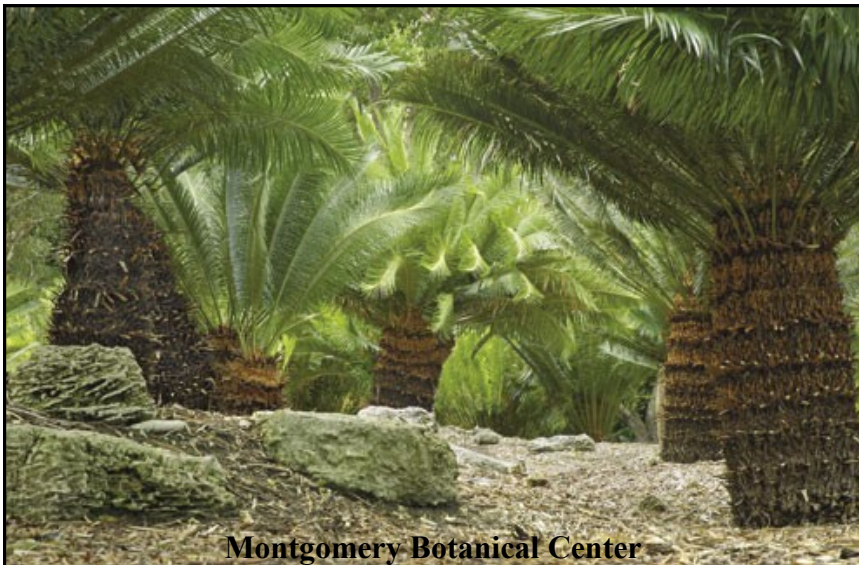
Montgomery Botanical Center