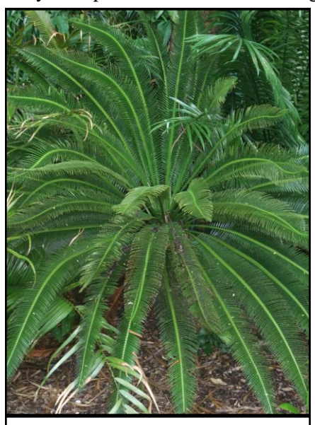
Dioon merolae growing at Fairchild Tropical Botanical Garden.

elevations of 2,000 to 4,000 feet. In habitat, the stems can grow 8 to 16 inches in diameter and 10 feet tall. Very old specimens can sucker and grow stems at odd angles. It is considered threatened in the wild and